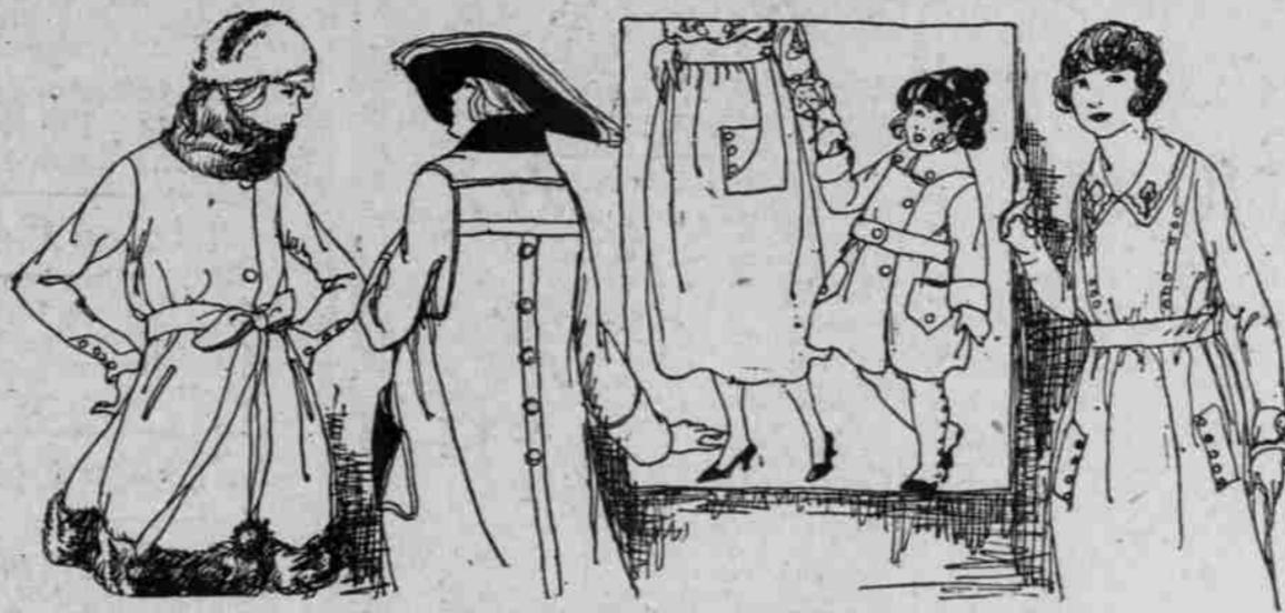
(SOME OF THE GARMENTS ILLUSTRATED.)