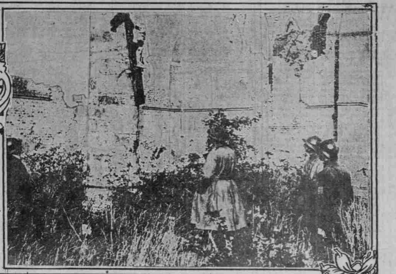
This remarkable picture proves the oft-repeated assertion that German shell-fire failed to dislodge many crucifixes in churches in Belgium. The picture shows the ruins of the Catholic church at Neuport.

And, consequently, above all, put your trust in God. (Continuation of Cardinal Mercier's letter of justification to Baron von Bissing, governor-general.)