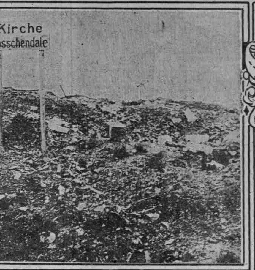
The picture shows the spot where the church of Passchendale stood before the Germans overran Belgium. The invaders put up a sign so they would know the place.

"Imagine a belligerent nation, sure of its army corps, its munitions, of its command, able to bear off victory. God may allow to be propagated in its ranks the germs of an epidemic at which the spot would be the forecast of the most optimistic..."