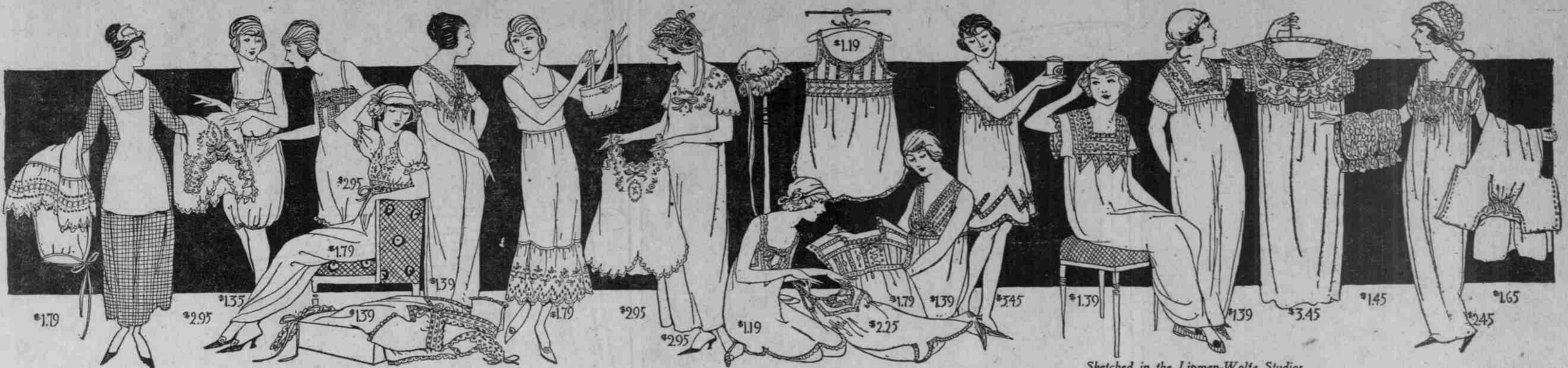
Sketched in the Lipman-Wolfe Studios.

Tomorrow's Charge Purchases Throughout the Store Will Appear on Bills Rendered February First