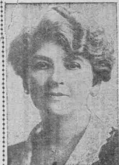
May Robson, who is to appear here in "Fish."

"The attendant joys and vicissitudes of every phase of theatrical production have been mine," said Miss Robson.