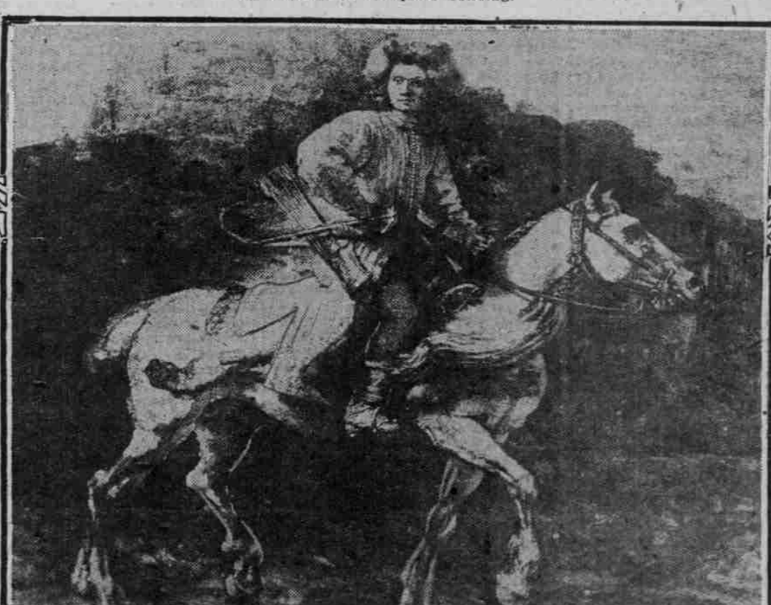
Gem of Frick Art Collection, Rembrandt's 'The Polish Rider.'