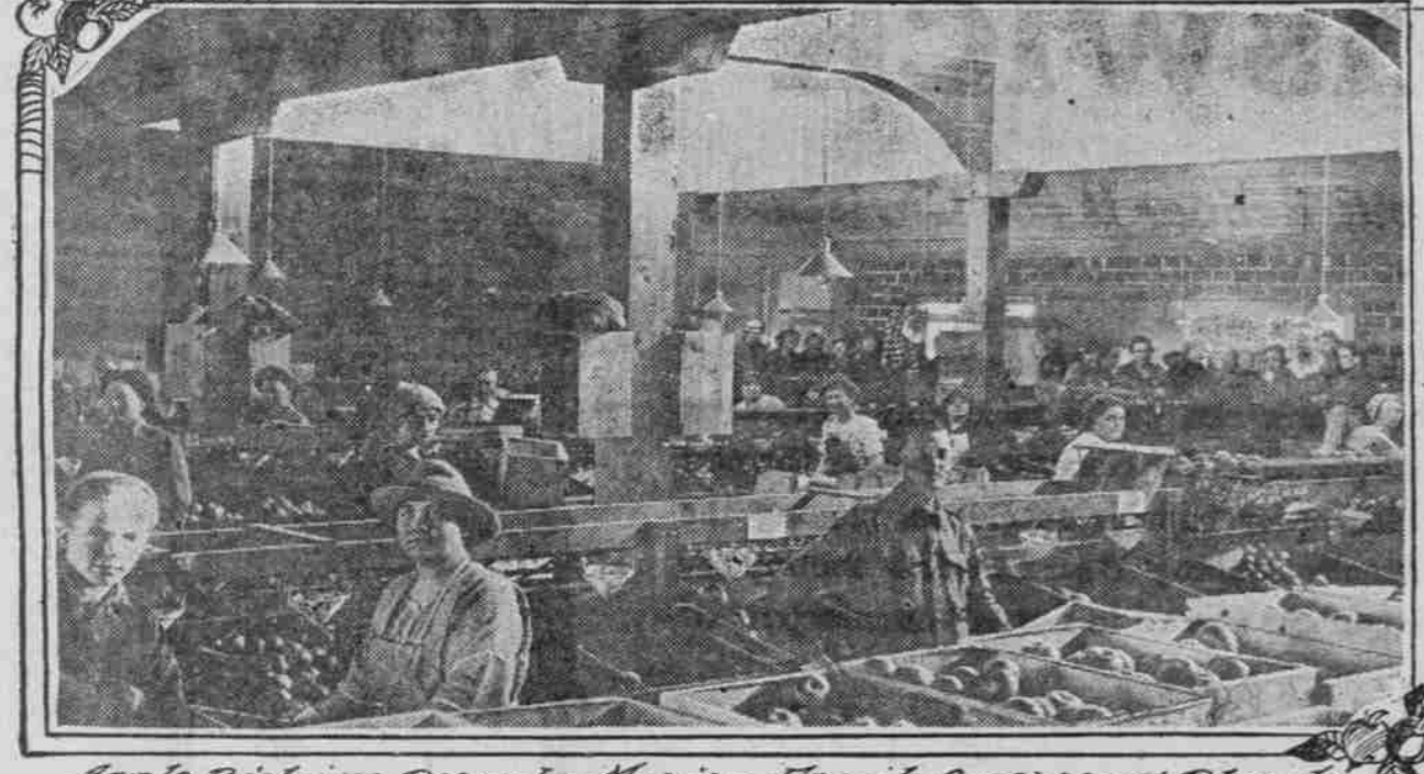
Apple Picking in Grove in Mosier Fruit Growers' Plant.

W HEN I speak of the Mosier fruit district I mean that portion of Wasco county that borders on the south side of the Columbia river, the county of Hood River on the west and a range of hills on the east and south. The town of Mosier, the trading point of this district, lies on the Columbia river and the O.-W. & N. railroad. It is distant about six miles from the town of Hood River on the west, and The Dalles on the east. The town of Mosier, the trading point of this district, lies on the Columbia river and the O.-W. & N. railroad. It is distant about six miles from the town of Hood River on the west, and The Dalles on the east. The town of Mosier, the trading point of this district, lies on the Columbia river and the O.-W. & N. railroad. It is distant about six miles from the town of Hood River on the west, and The Dalles on the east.