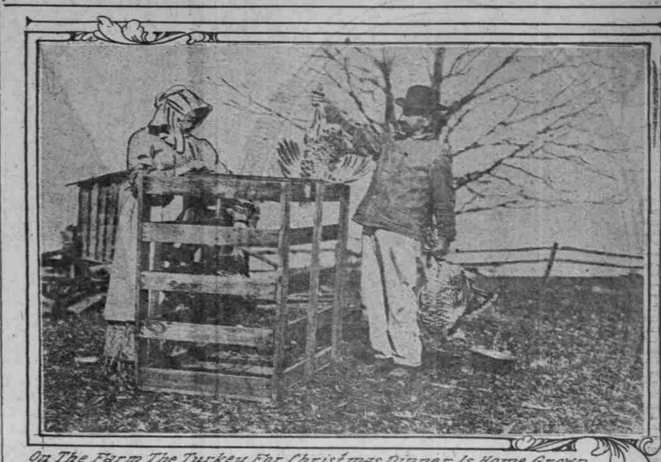
On The Farm The Turkey For Christmas Dinner Is Home Grown.

Every Section of Country Has Contributed Its Quota for Repast That Will Be All-American—Foreign Delicacies Replaced From "Soup to Nuts" by Products Grown Here.