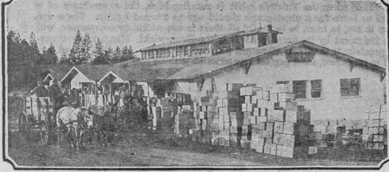
Plant of Mosier Fruit Growers Association.