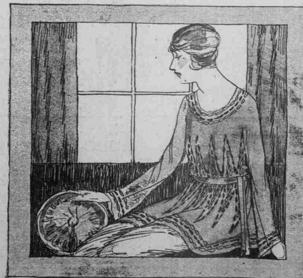
Sketched in the Lipman-Wolfe Studios.

This Store Uses No Comparative Prices—They Are Misleading and Often Untrue