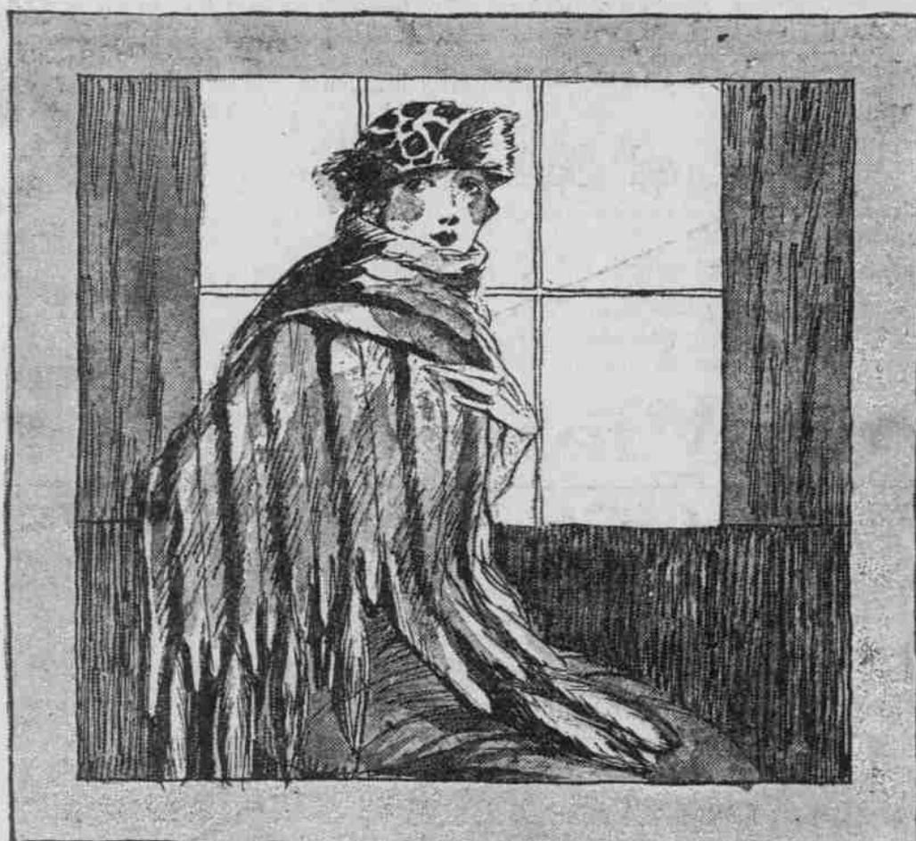
Sketched in the Lipman-Wolfe Studios.

Without Reservation or Restriction We Announce Beginning Tomorrow