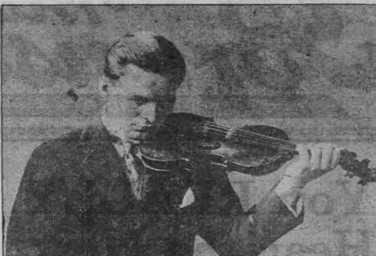
ALBERT SPALDING, WHO WILL APPEAR WITH SYMPHONY.

NOTED VIOLIN SOLOIST OBTAINED FOR PORTLAND CON- CERT WILL BE HEARD IN FIFTY-EIGHT AMERI- CAN CITIES THIS SEASON.