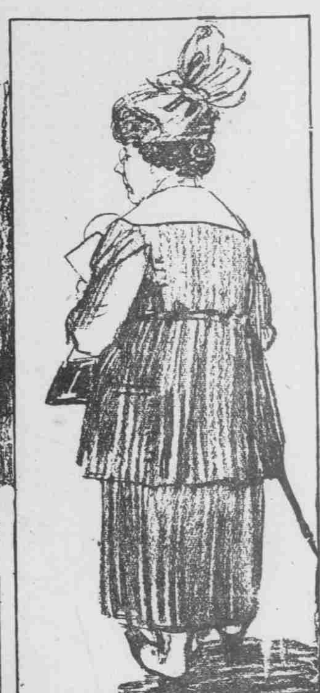
Lady with a hard cold and no rubbers walking a wet pavement on her heels.