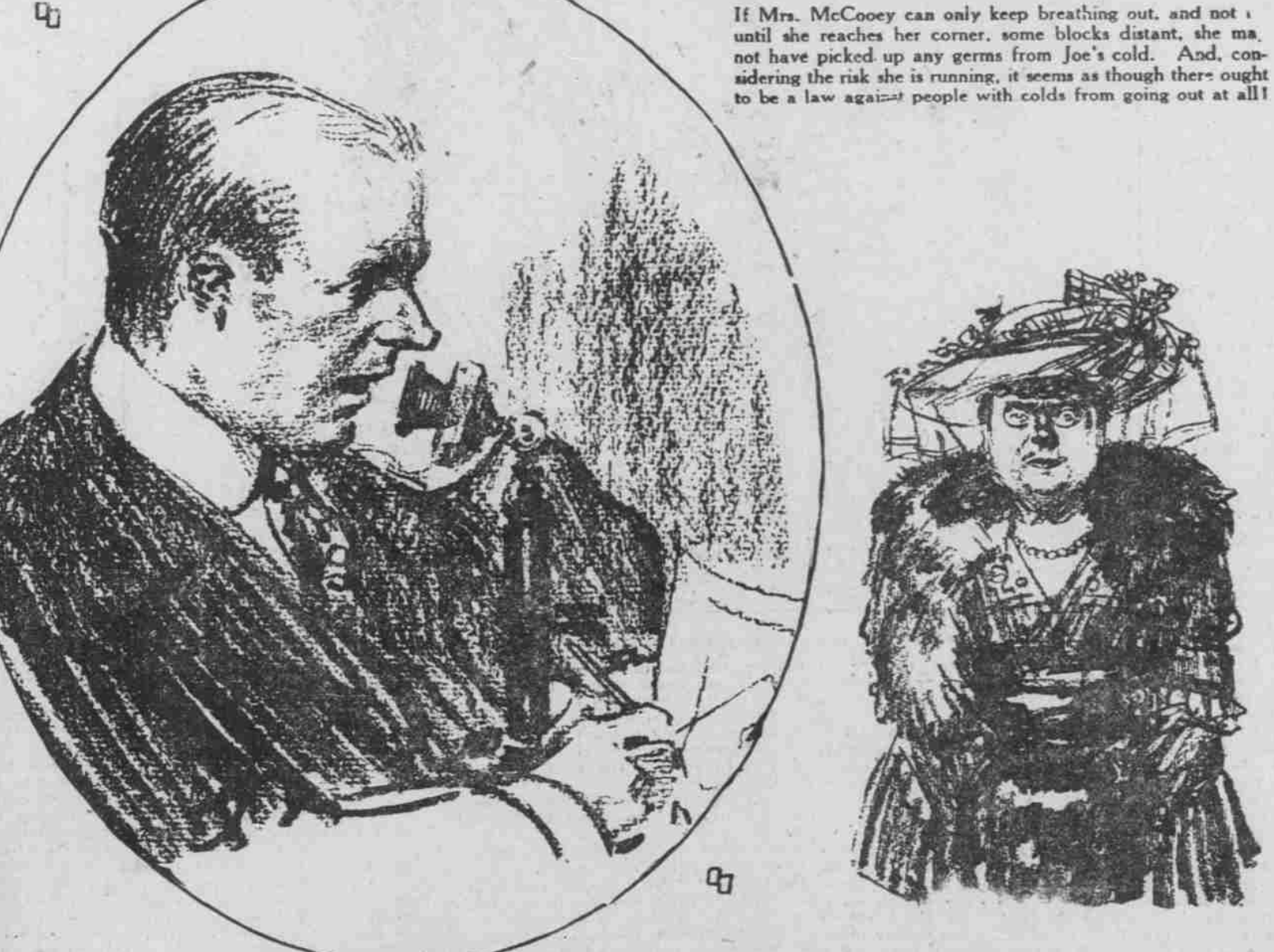
"Vaderbild two sigs four sigs . . . ! lab speagig iddo de receiber!"