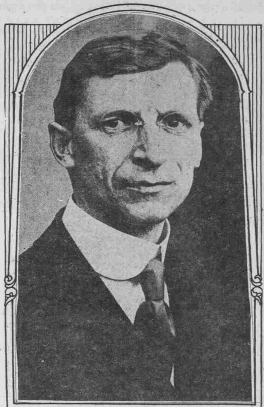
Eamon De Valera