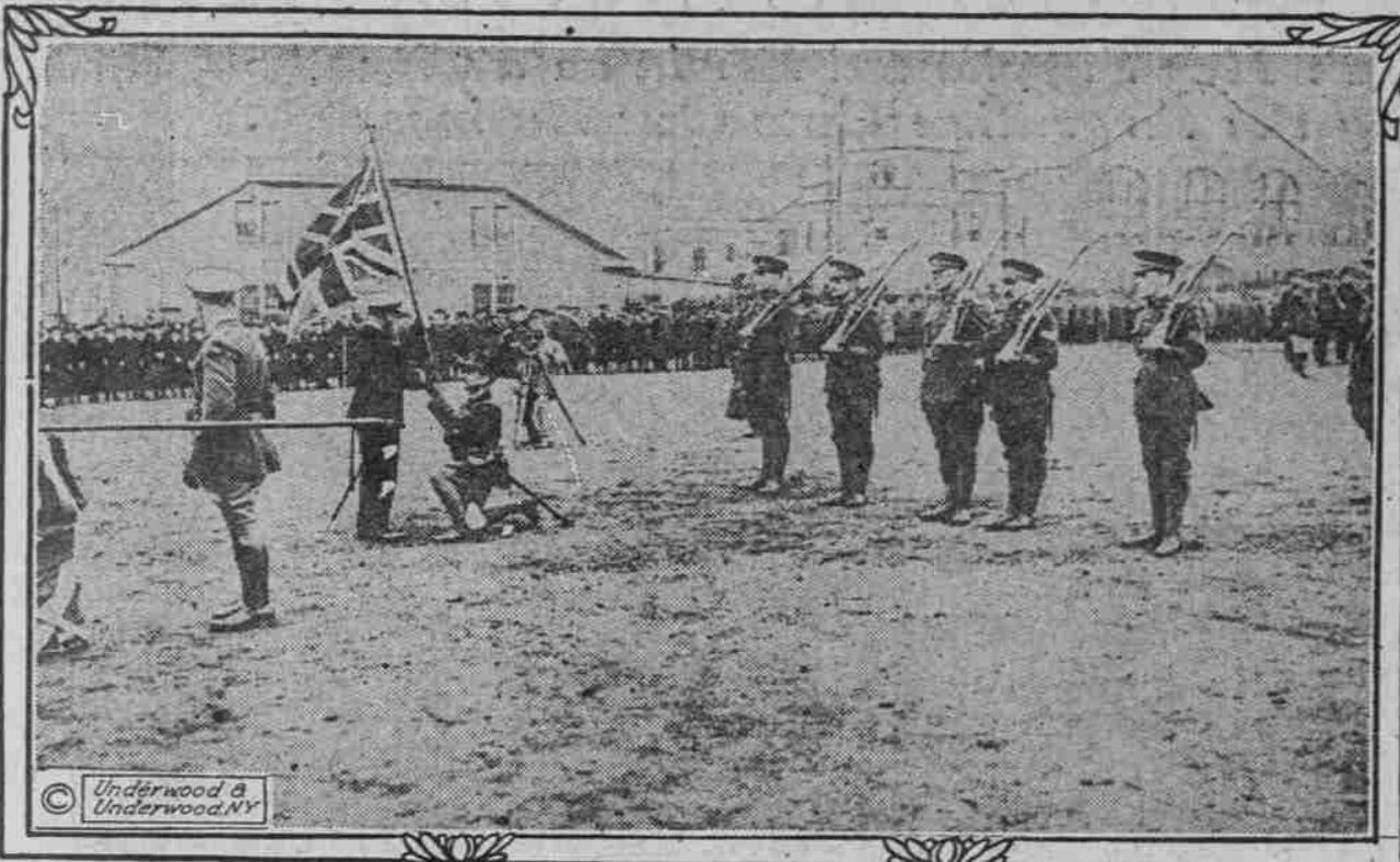
The Prince Of Wales In St. Johns, N.B.