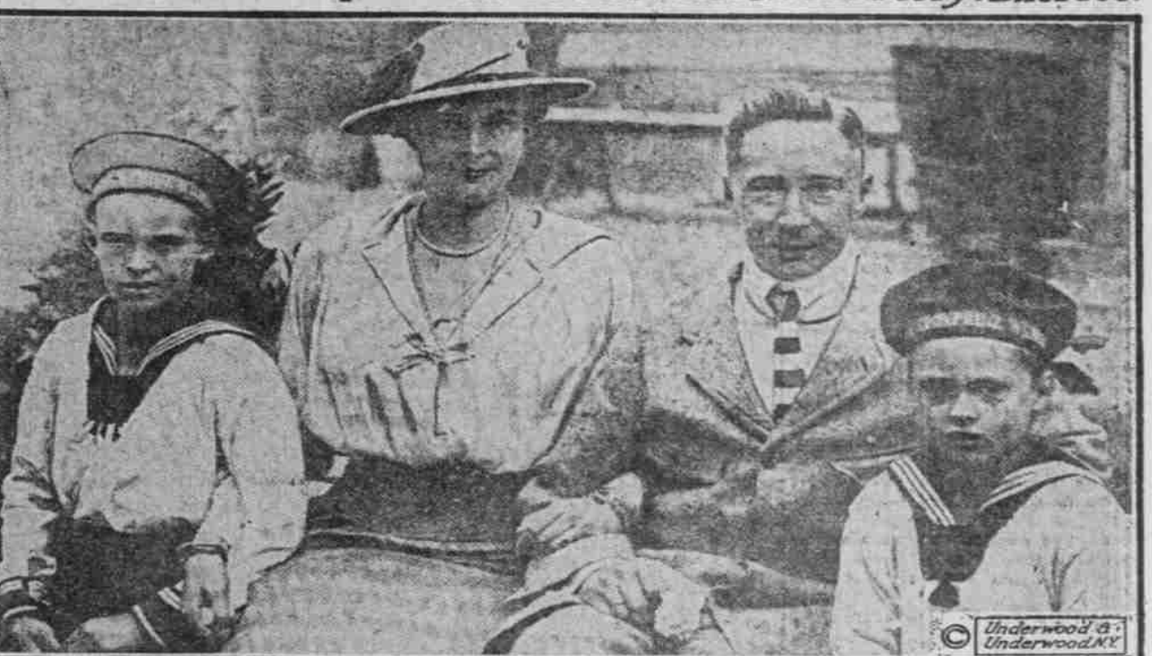
German Ex-Crown Prince And Family, At Wieringen.