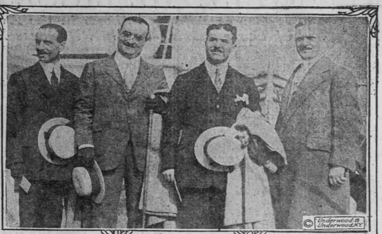
Famous Sistine Chapel Choir From Vatican Touring America.

A practical demonstration of what an American submarine can do was given by the H-3 in the Hudson river, before a crowd of more than 2000.