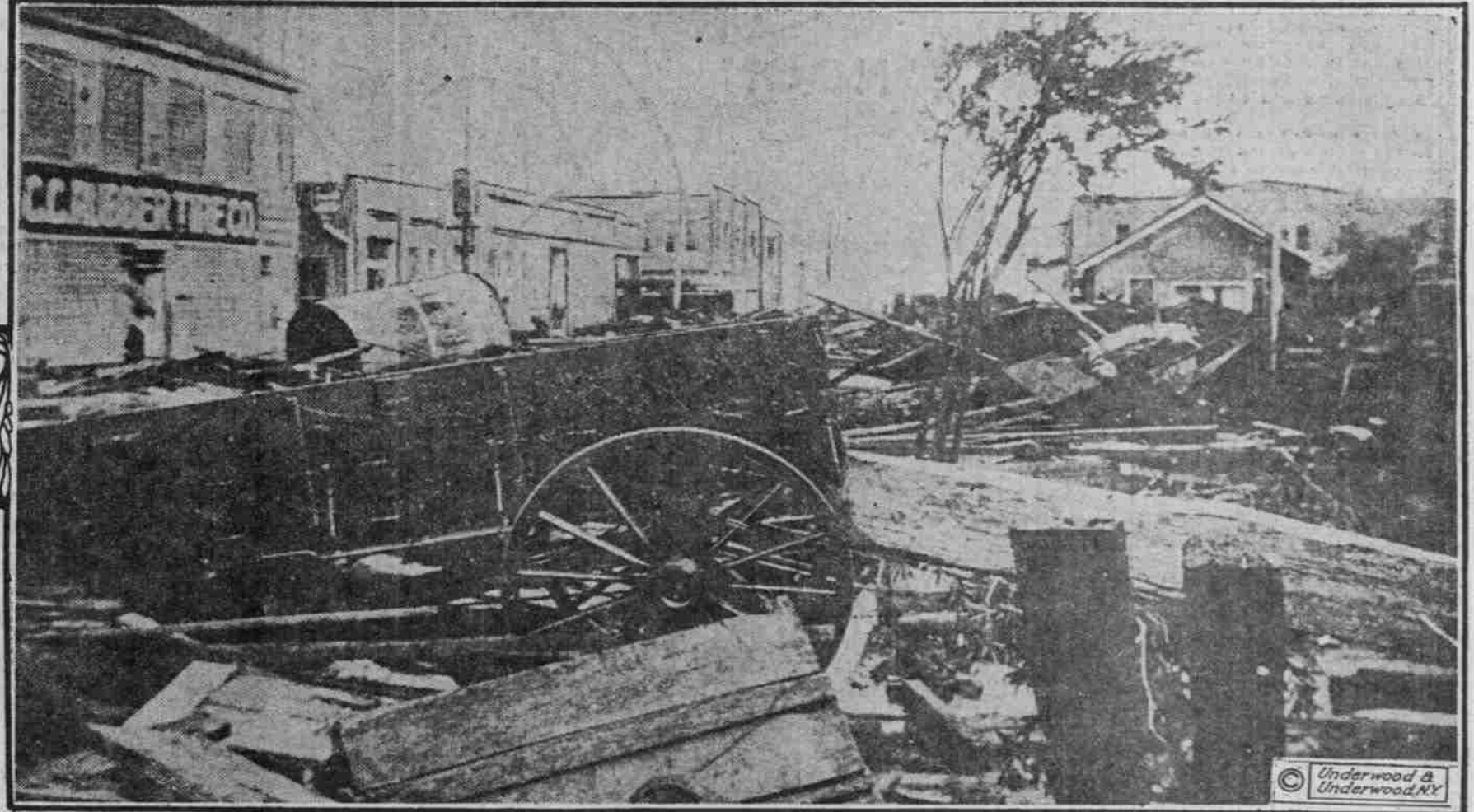
Tornado Swept Corpus Christi.