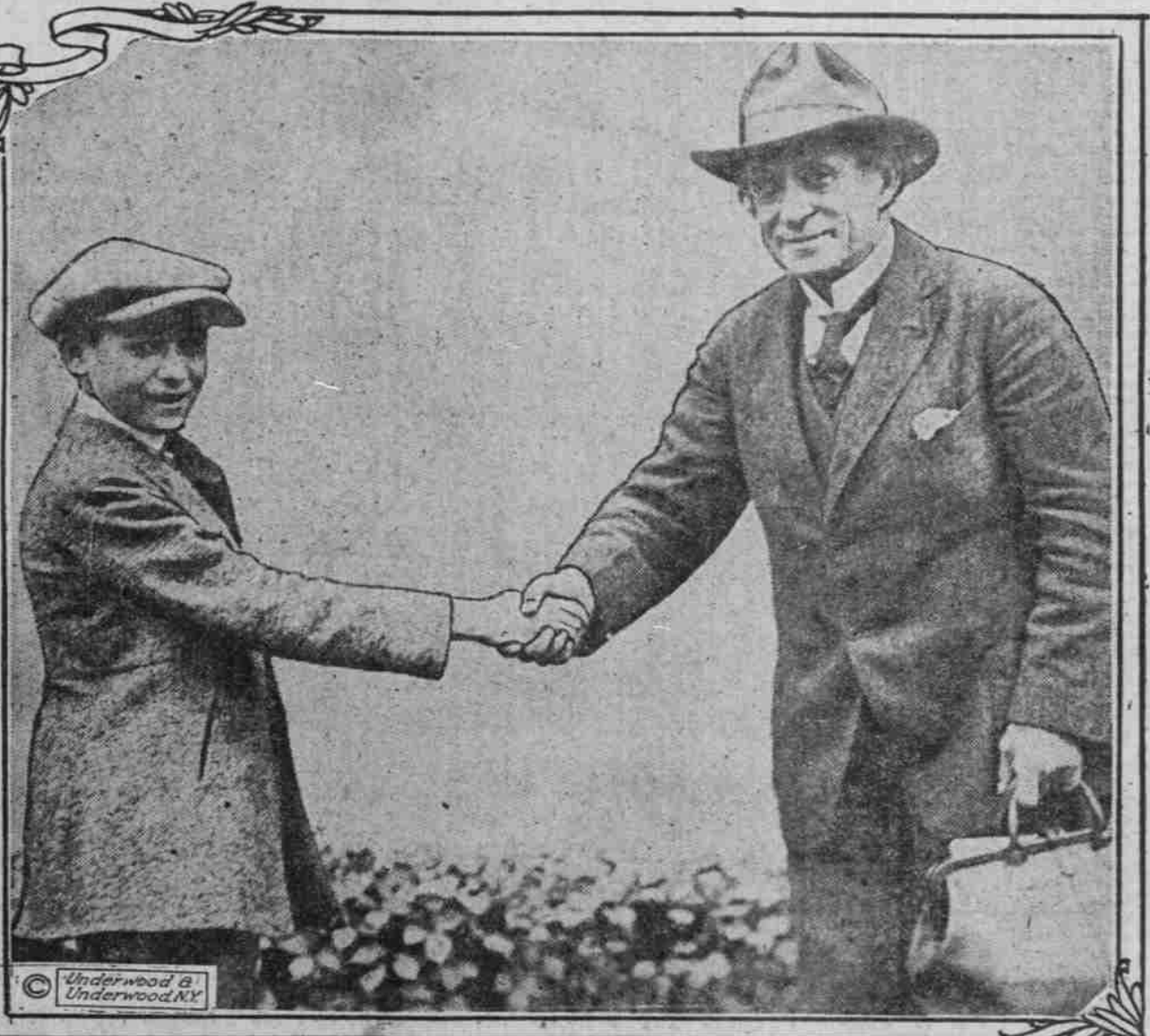
The Youngest And Oldest Freshman To Enter Harvard.