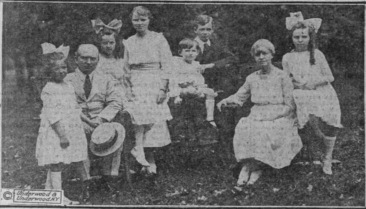
Secretary To The President And His Family.