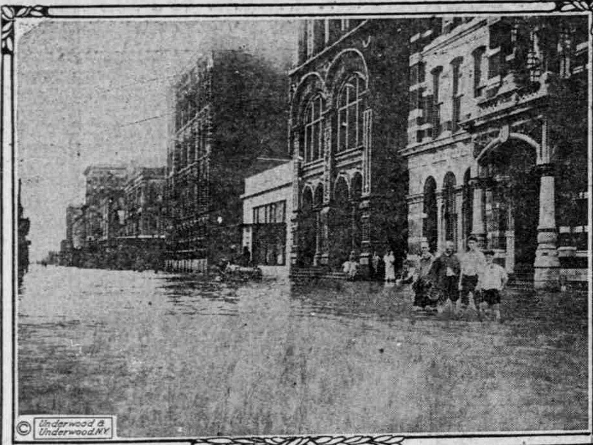
Heart Of Galveston Business Section Flooded In Disaster.

THE business section of Galveston was flooded by the disastrous tidal wave that swept the Gulf coast and caused loss of life and great damage at Corpus Christi. The new seawall at Galveston has prevented greater damage, although considerable loss was caused by the waters.