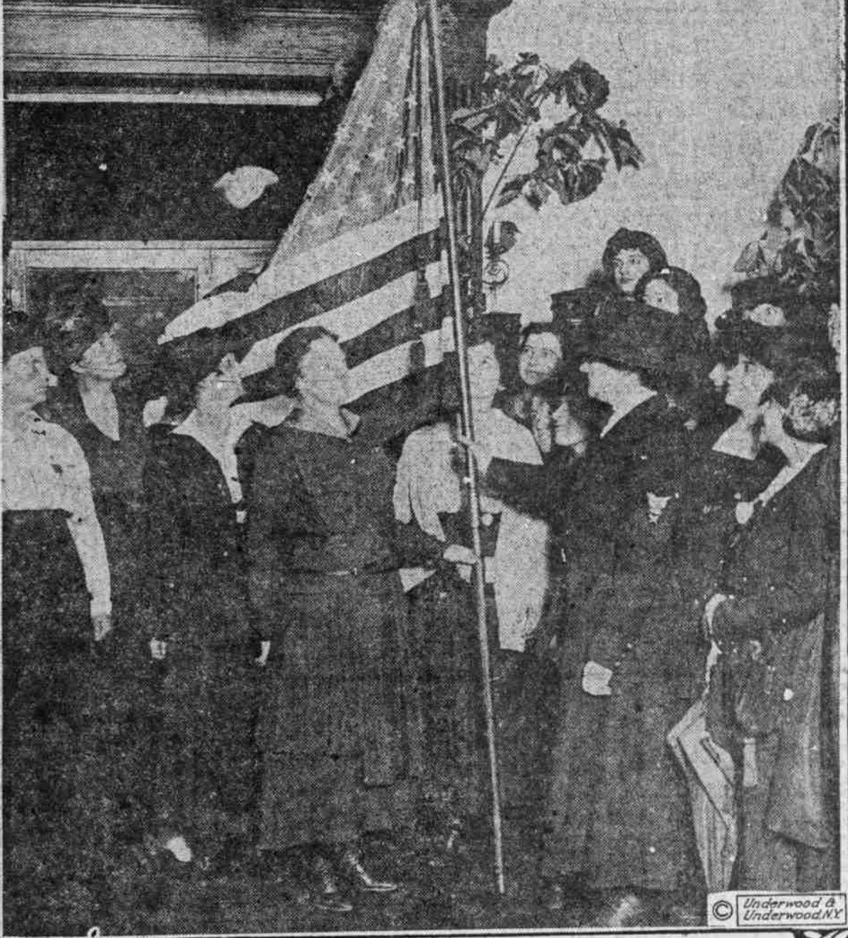
First Women's Post Of American Legion Gets Flag.