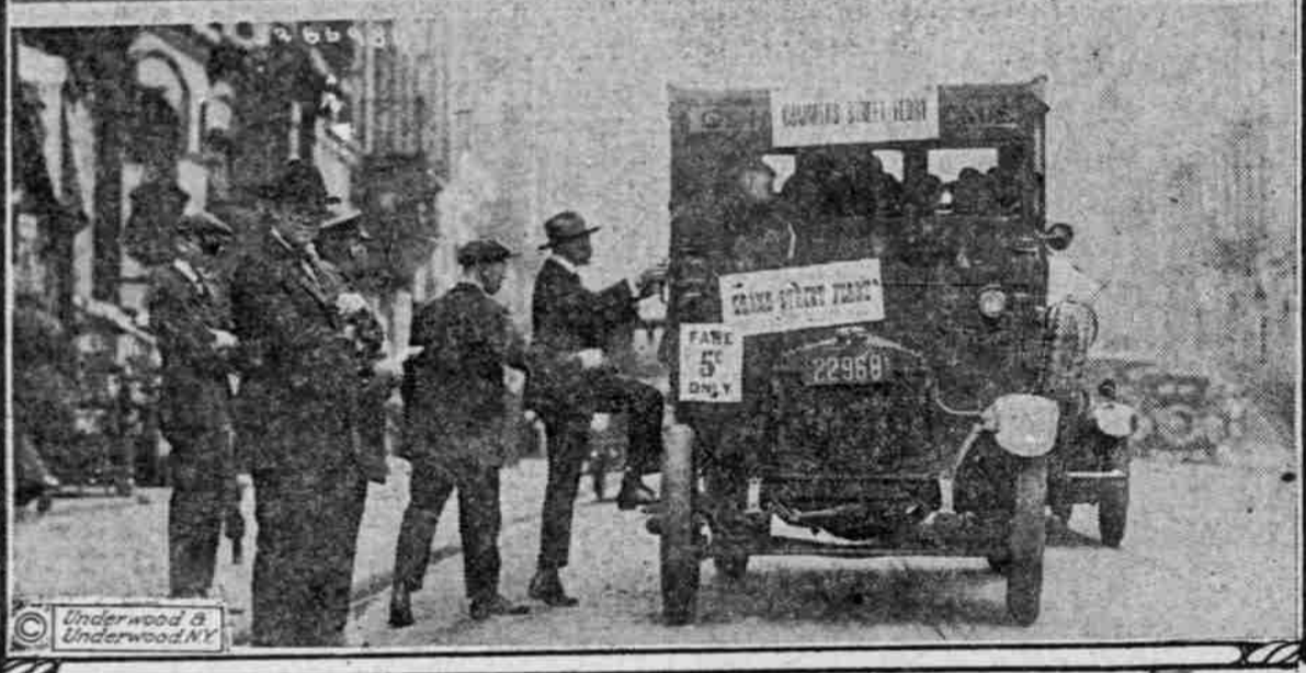
New York Trolleys Stop! Busses Take Their Places.