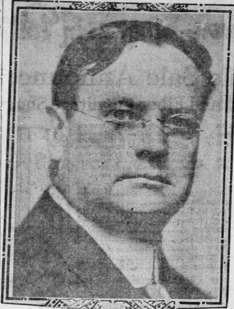
HIRAM W. JOHNSON, WHO IS CAMPAIGNING AGAINST THE LEAGUE OF

CALIFORNIA'S FIGHTING SENATOR WHO WILL SPEAK IN PORT-