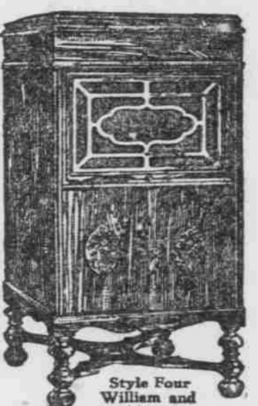
Style Four William and Mary