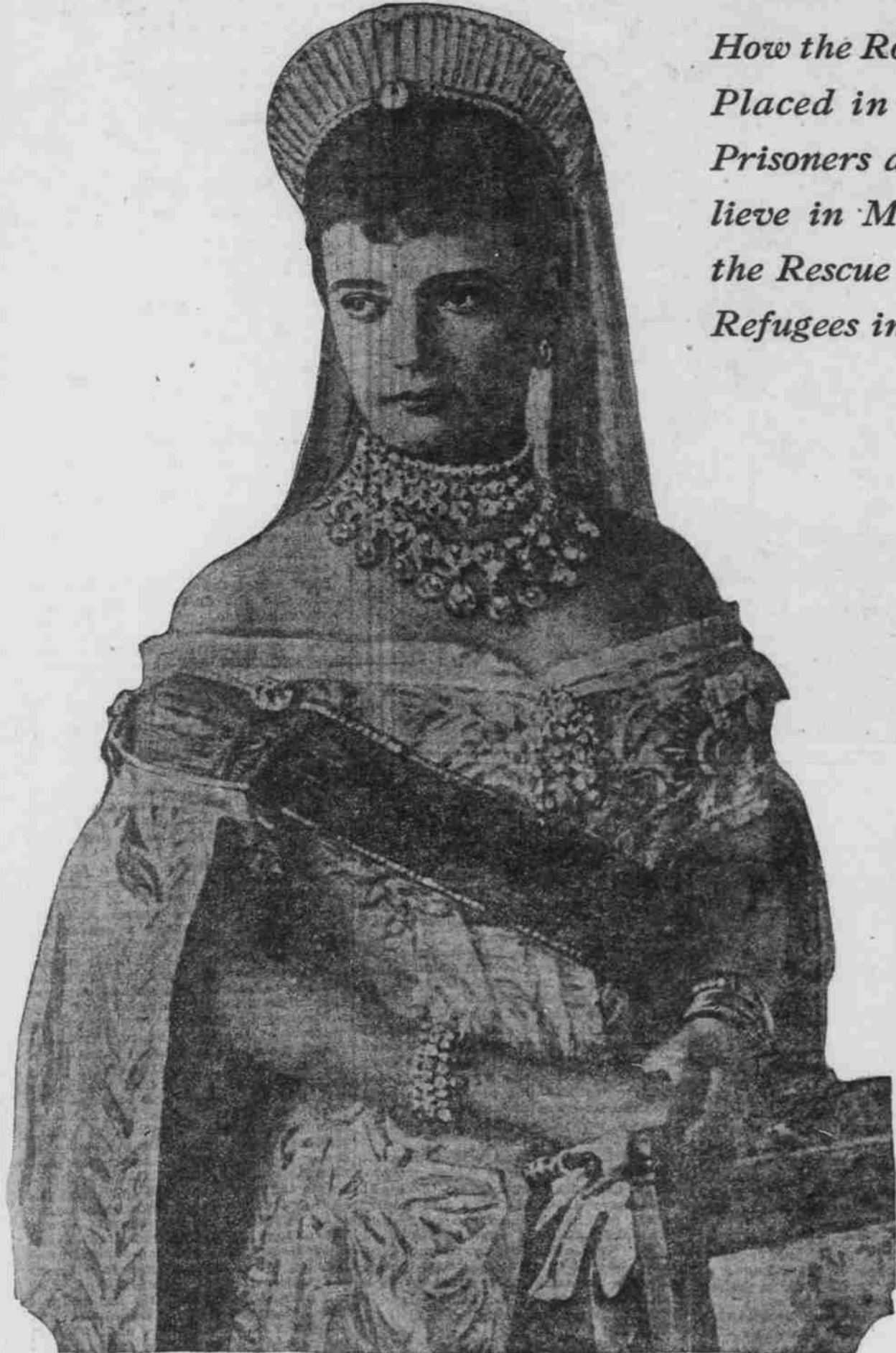
The Queen Mother Marie, Widow of Alexander III.

How the Rough Guard, Who Was Placed in Charge of the Royal Prisoners and Who Did Not Believe in Murder, Accomplished the Rescue of the Group of Titled Refugees in Southern Russia