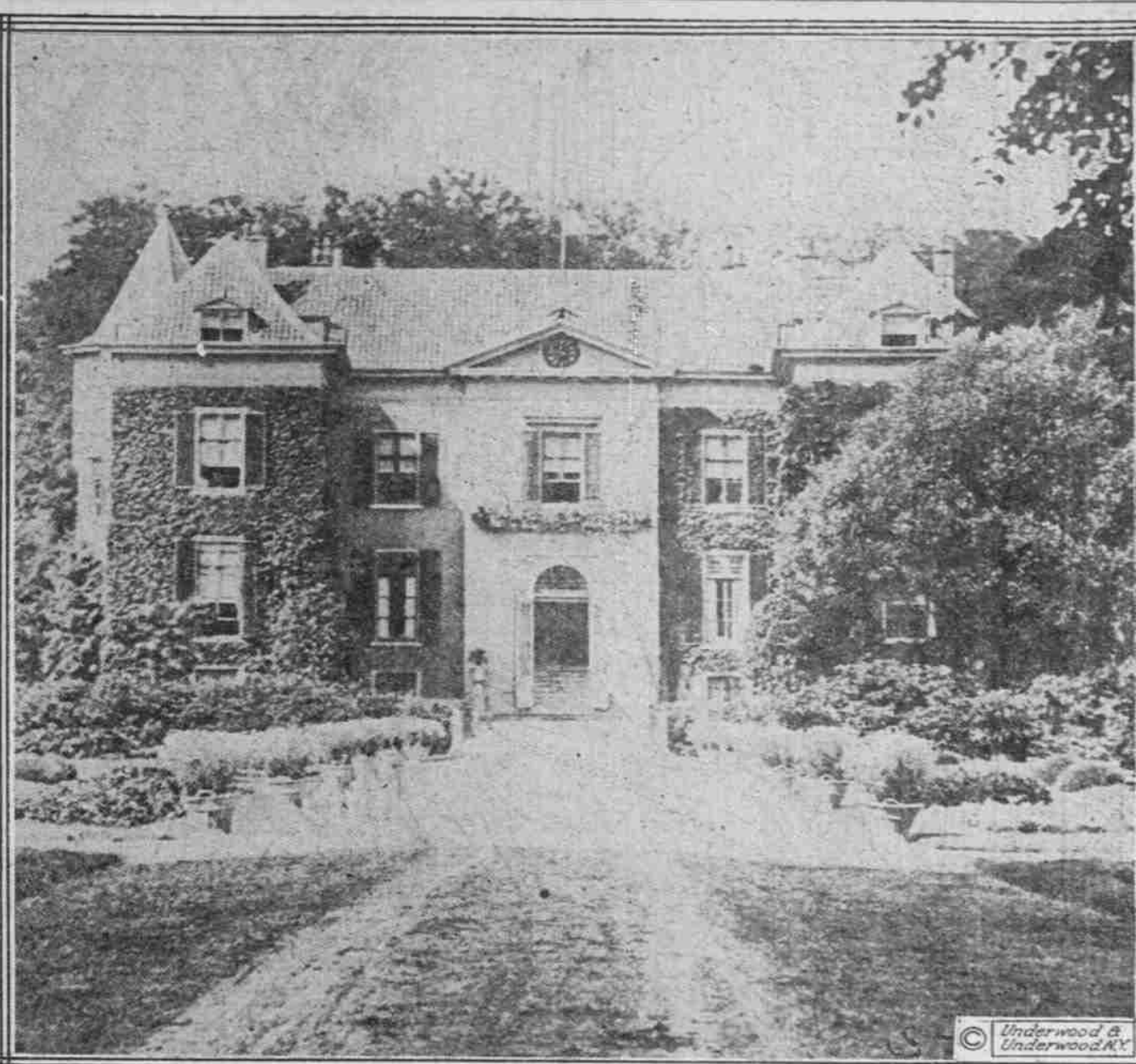
Holland Castle Bought By Ex-Kaiser