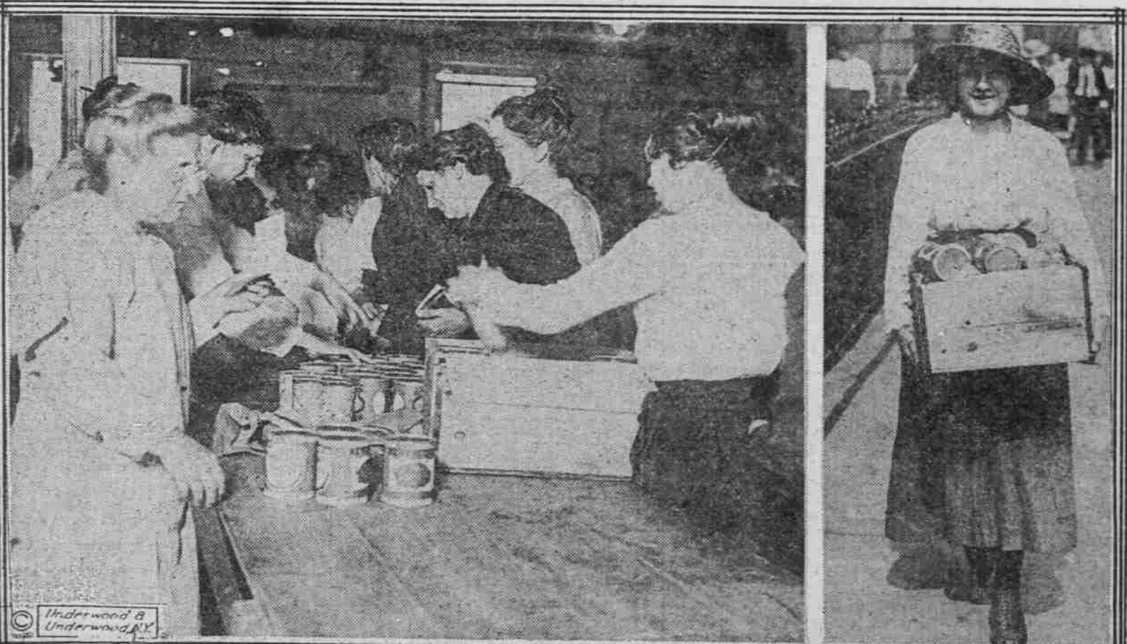
Army Food Sales Break Profiteer Prices in New York