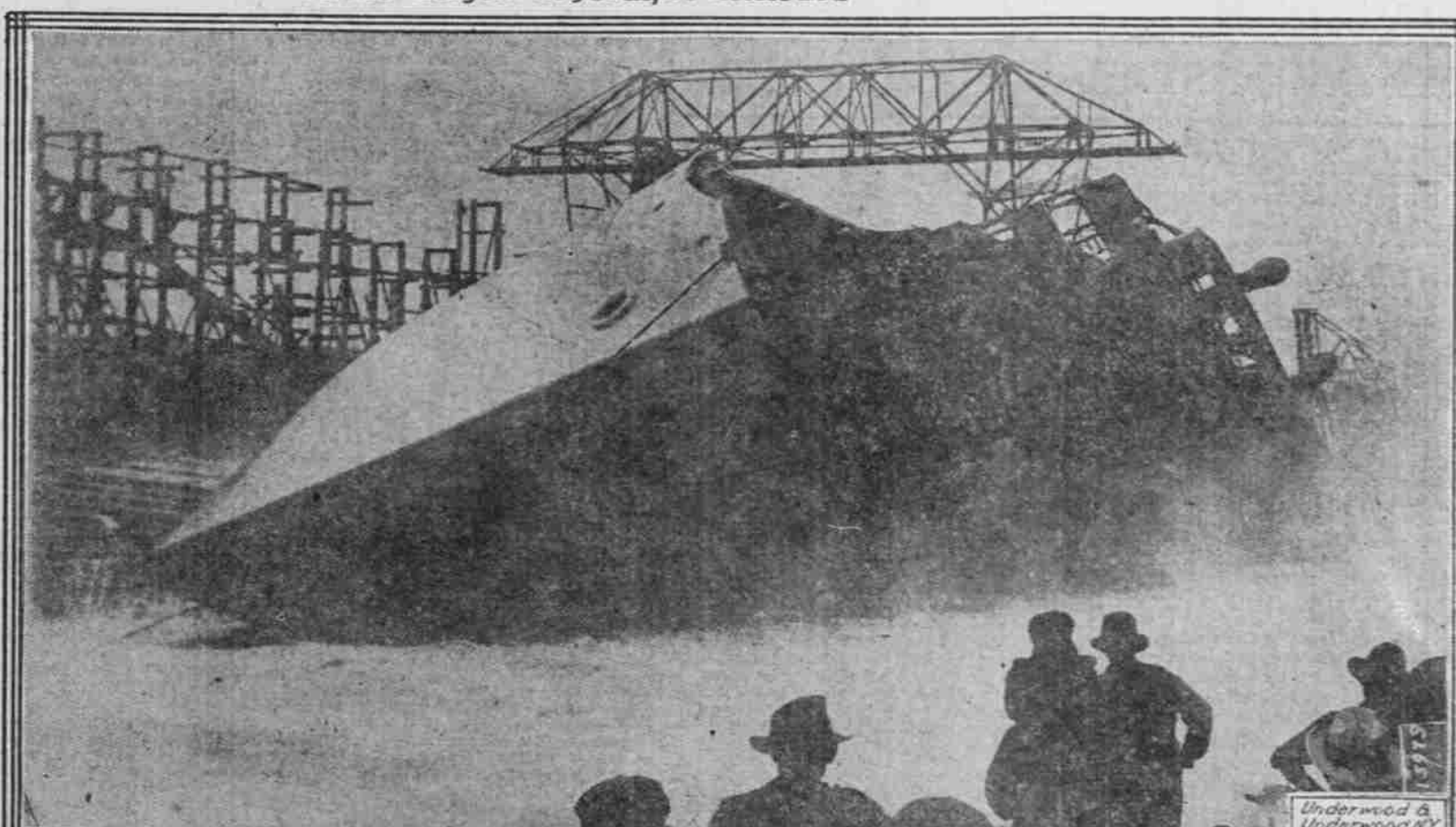
Most Remarkable Ship Launching In History Occurs At Buffalo