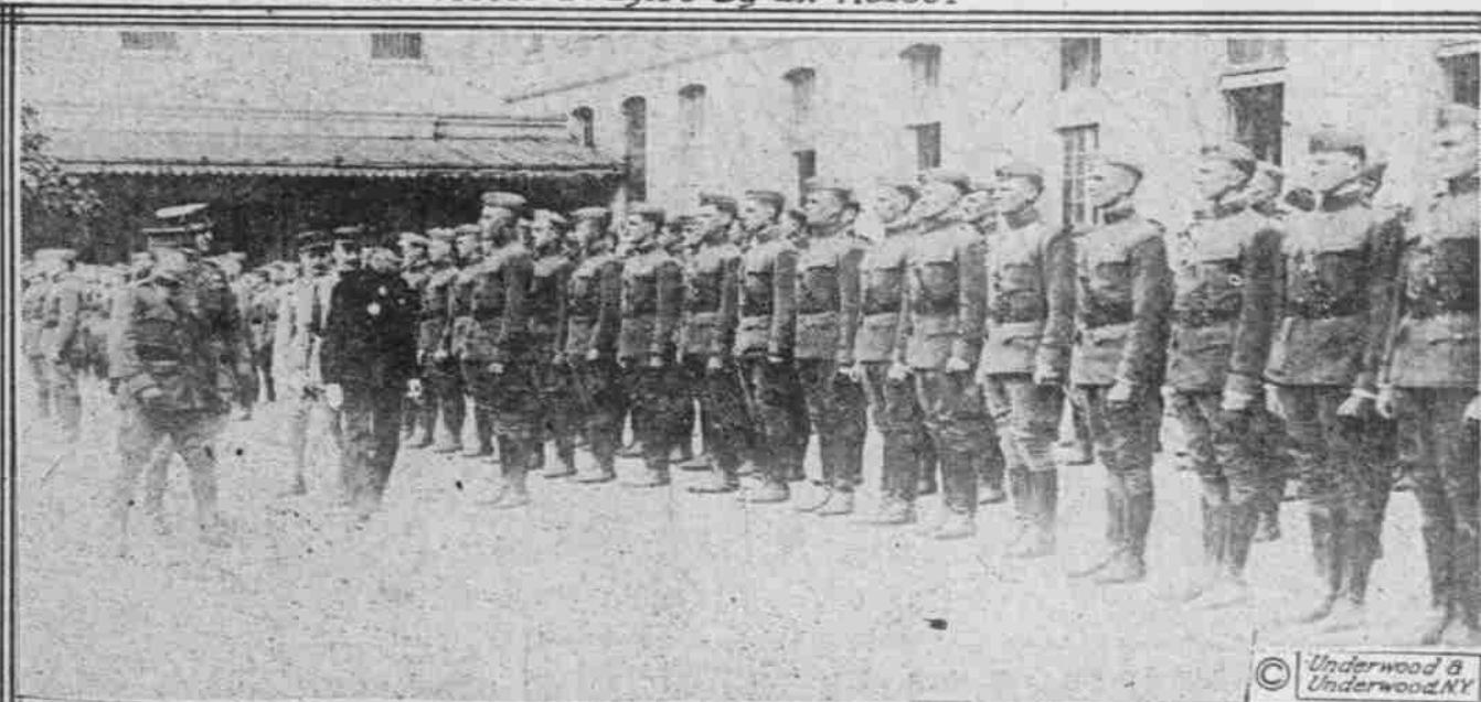
Inspecting West Point Cadets In France