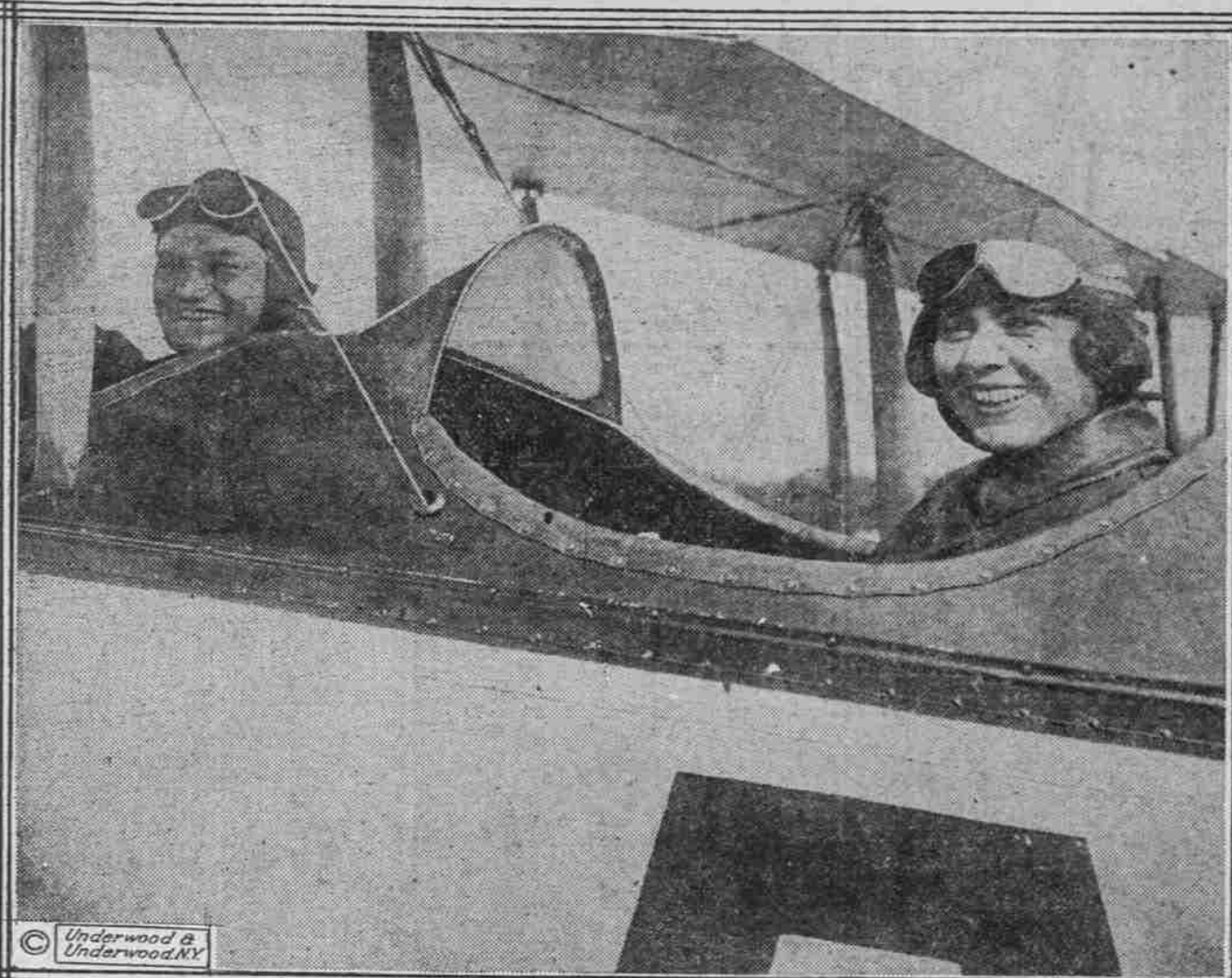
Bolivian Minister's Daughter Makes Aerial Flight