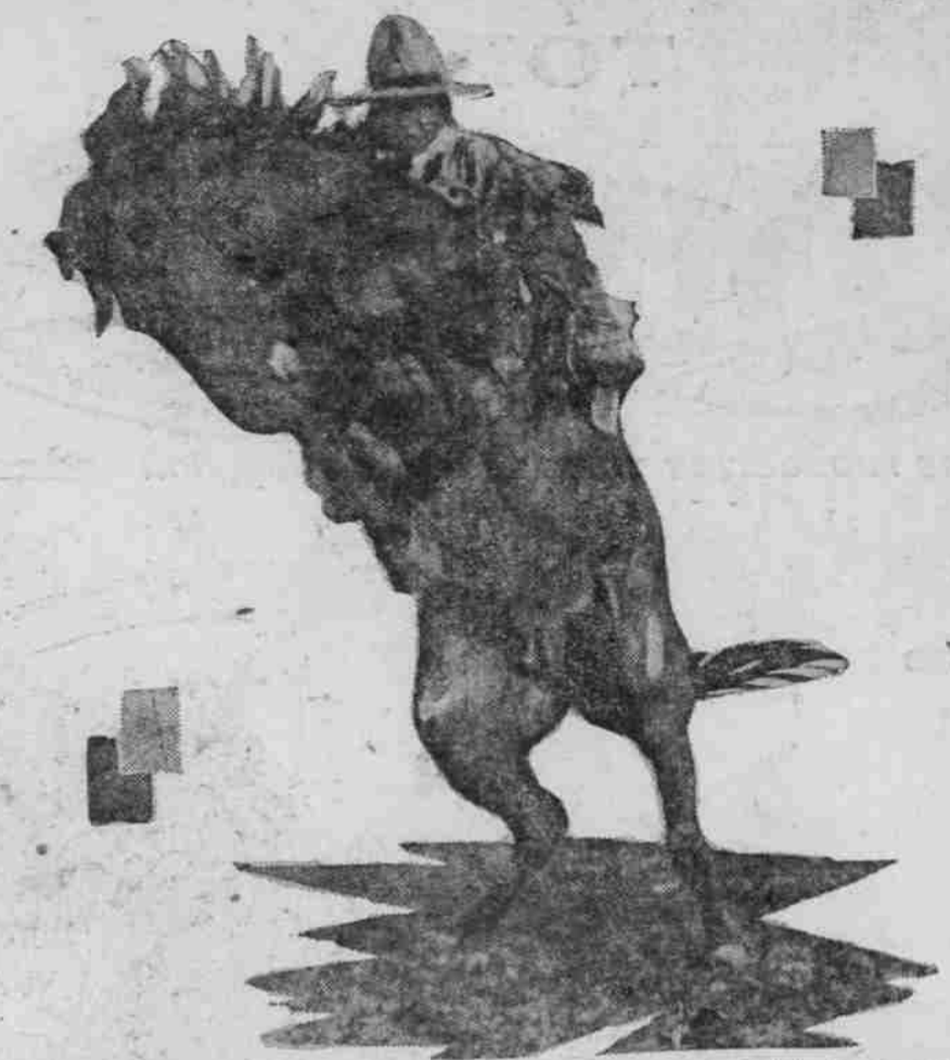
PHOTOGRAPHS DEPICT STUNTS AT PENDLETON ROUND-UP.