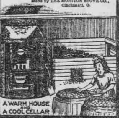
A WARM HOUSE A COOL CELLAR

25-Original Patented Pipeless Furnace and have you read some of the letters in this book. It is a furnace that heats through only one register. It's a wonder. Thousands of owners heat their homes perfectly through the coldest weather of last winter with a third less fuel than formerly.