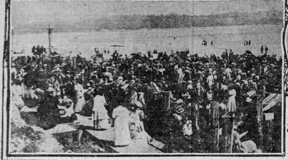
Scene on Yaquina Bay at Newport.

Train Met Daily by Crowd of Cottagers Ready to Welcome Newcomers to Rough and Ready Vacation.