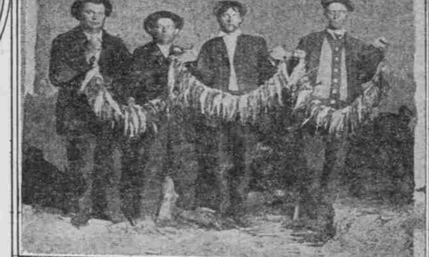
A Big Catch at Newport

G EARHART, Or., Aug. 9.—(Special.)—Gearhart's cluster of silver-gray summer homes are filled with summer people, bent on enjoying the beach life. A pleasing informality characterizes life at the resort; proving a welcome change from the city. Now that war activities are no longer claiming the nights and days, cottagers have relaxed to do nothing or to entertain. They see fit to waste time if they like—in any event to live in rather off-hand manner, unbothered by too many social demands.