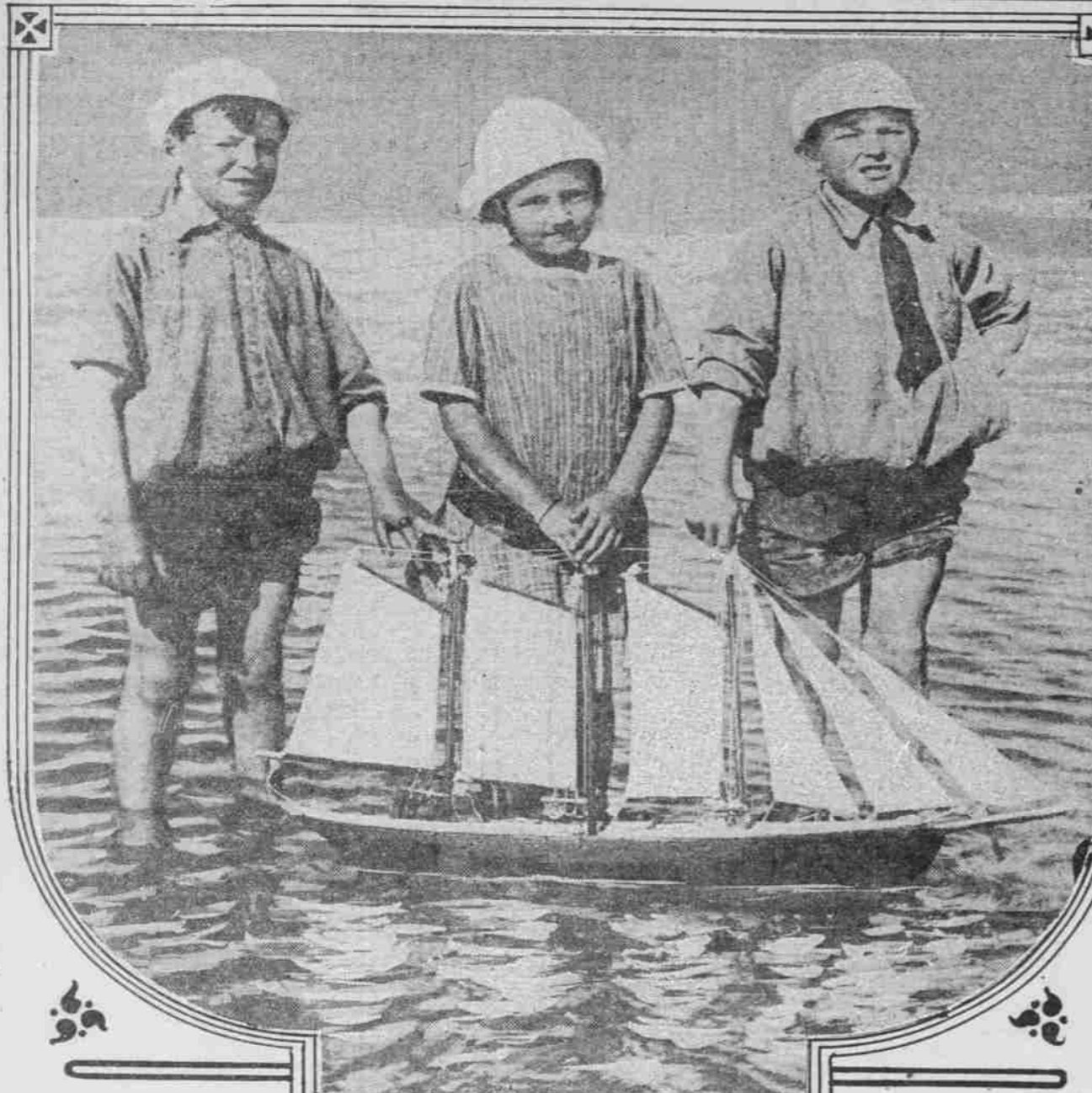
Three Little Sails

Portland Vacationists at Seaside Resorts Enjoy Frolicking in Big Waves or Outings at Night on Sands Beside Roaring Seas, and Social Affairs Are Numerous.