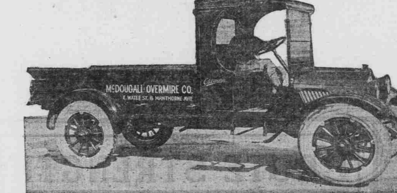
Body Dimensions 3 Feet 10 Inches by 8 Feet 2 Inches Delivered to McDUGALL-OVERMIRE CO. (Structural Engineers)