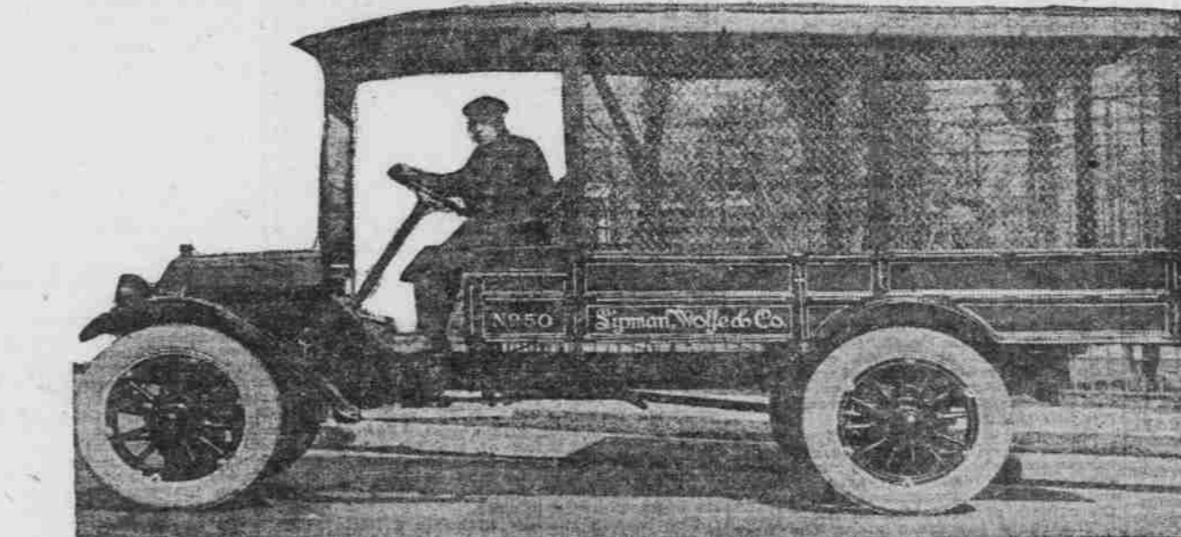
Body Dimensions 5 Feet by 9 Feet Delivered to LIPMAN-WOLFE CO. (Merchandise of Merit)