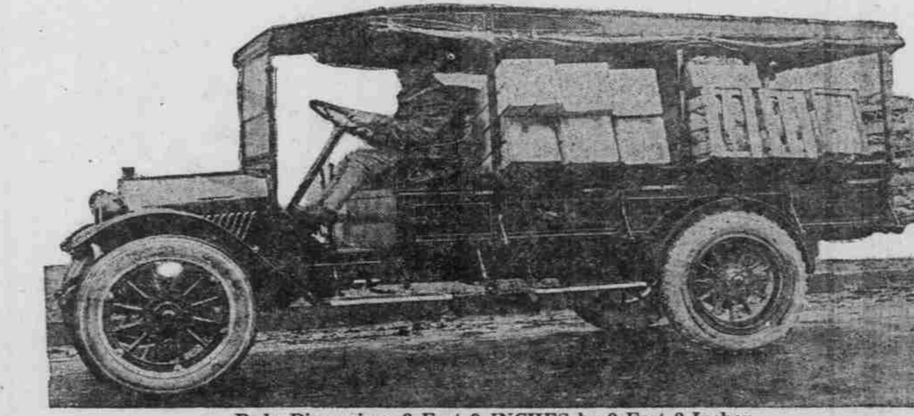
Body Dimensions 3 Feet 9 INCHES by 9 Feet 3 Inches Delivered to MARK-LEVY & CO. PRODUCE (Fresh From the Garden)

Four Distinctive Firms Using Oldsmobile Trucks