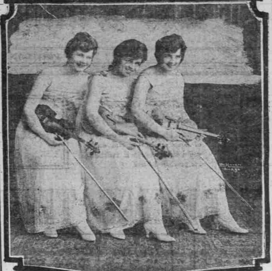
The Three Moran Sisters at the Hippodrome