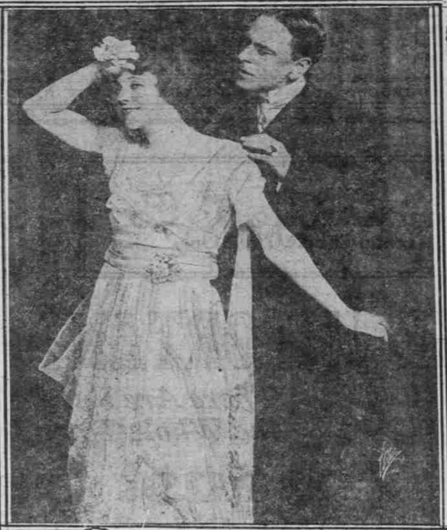
Ruth Chatterton and Sydney Booth, in Comedy "The Merrie Month of May," at the Heilig.

"THE TENDERFOOT" AT ALCAZAR Western Operatic Comedy Is Full of Laughter. It would be hard indeed to find more swinging and characteristic music than will be heard in "The Tenderfoot," that great western operatic comedy that will be the attraction at the Alcazar theater beginning Monday, August 4. When "The Tenderfoot" toured