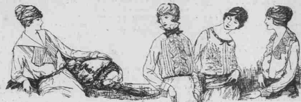
$5.45 $9.85 $9.85 $4.95

—Meier & Frank's: Fur Shop, Fourth Floor.