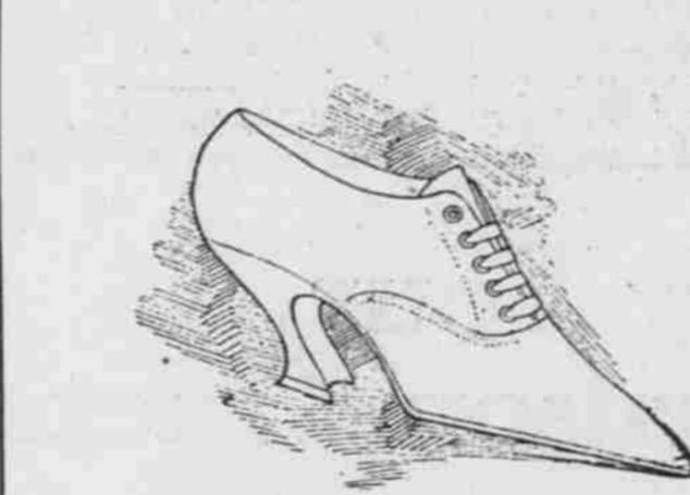
1825—Plain toe Oxford, of best grade white canvas, with turn sole and LXXV heel. Regular price $6.50—reduced to

New Styles Excellent Materials Great Varieties