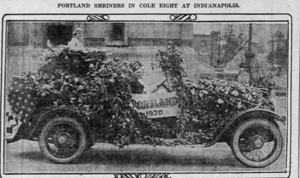
Here's one of the cars in which the Portland delegation made so fine a showing at the big parade. The car was furnished through the courtesy of the Cole Motor Car company, whose factory is at Indianapolis, at the request of the Northwest Auto company of Portland.

Probably no endurance contest has been so hotly contested in the motorcycle world of America as the transcontinental record from the Atlantic to the Pacific coast. As far back as 1906, when motorcycles were becoming