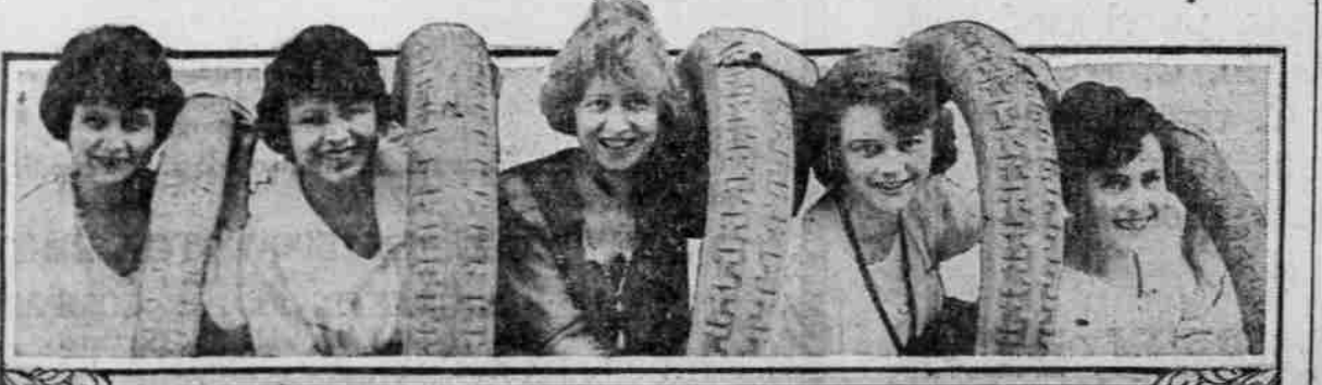
Each of the tires held by these pretty girls had been consigned to the junk heap before Gates Half-Sole tires came to the rescue and gave them a new lease on life. Something to make any motorist smile, isn't it?