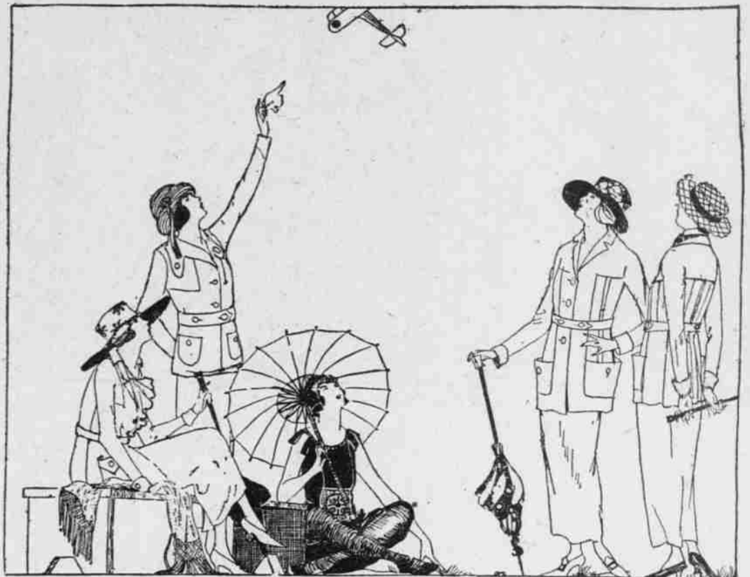
Suits as Sketched.