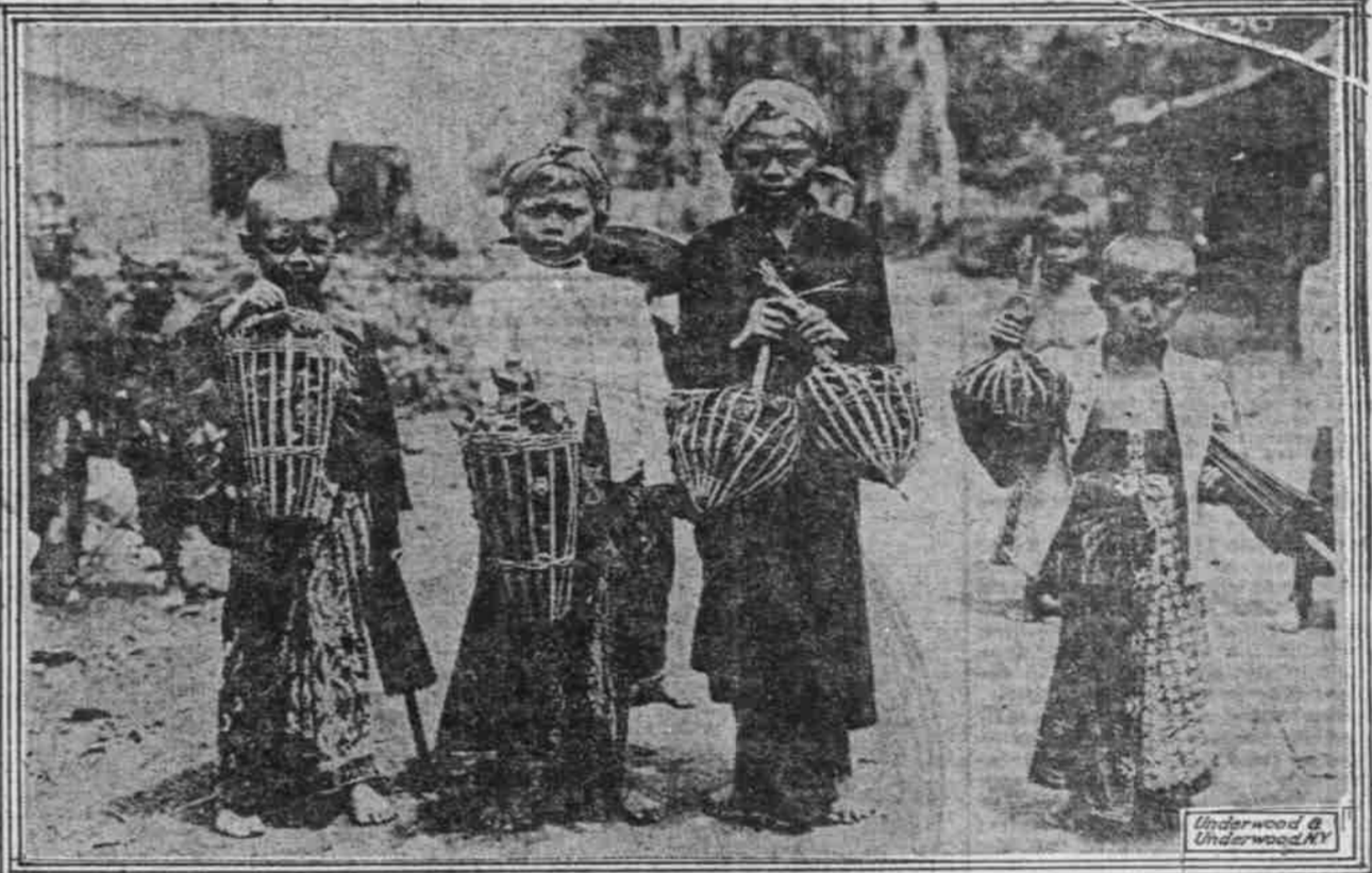
Javanese Children Peddling Coal