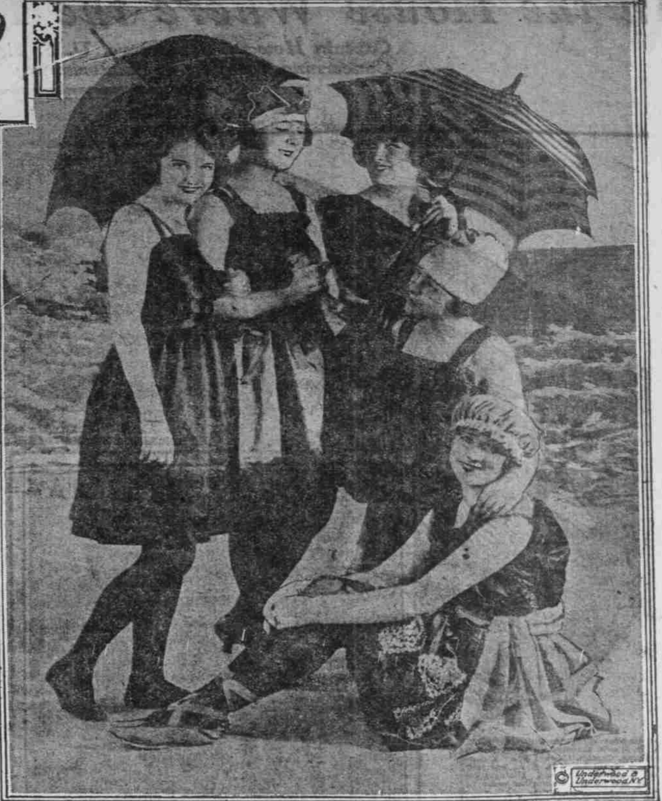
Beautiful U.S. Models To Help Canada Display Her Wearing Apparel.

People generally think of convalescence as a period during which the patient sits around waiting to get well. Judging from scenes in large military hospitals, the process of getting well is a pretty strenuous one for the wounded soldier. The portable electric oven is highly beneficial in its effects upon stiffened and inflamed joints. These modern therapeutic methods have saved many a veteran from lifelong mental or physical disability.