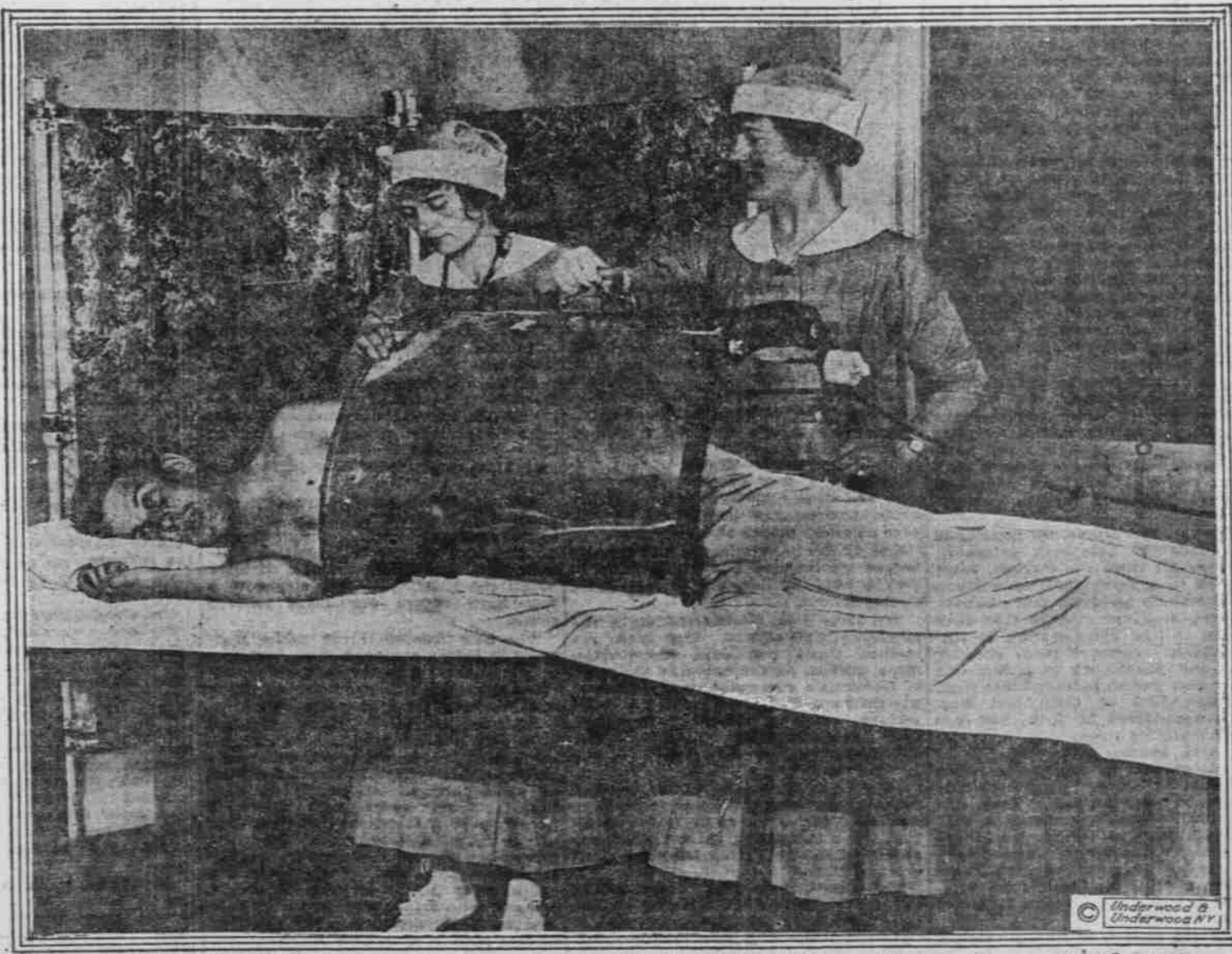
Novel Methods Of Treatment By Which Our Soldiers Are Restored To Health.