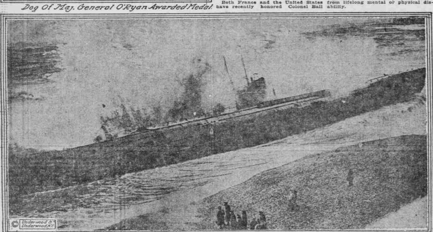
U-Boat Lashed By Waves At Hastings England.