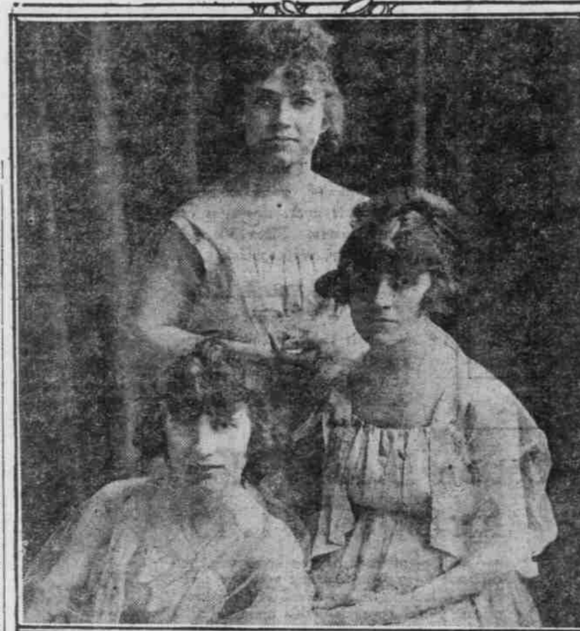
Three Musical Queens, at Hippodrome