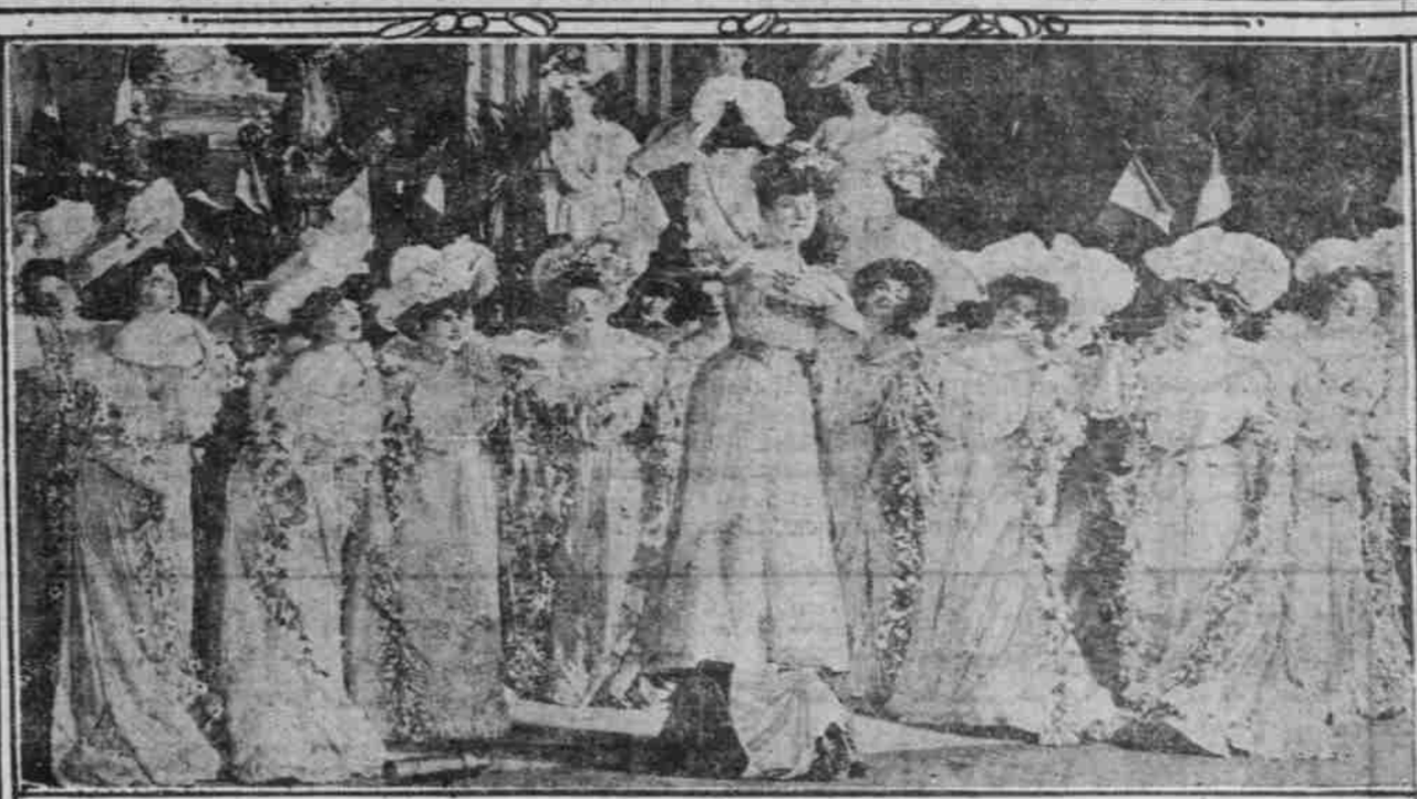
Alcazar Musical Comedy Co., in "Mlle Modiste," at Alcazar.