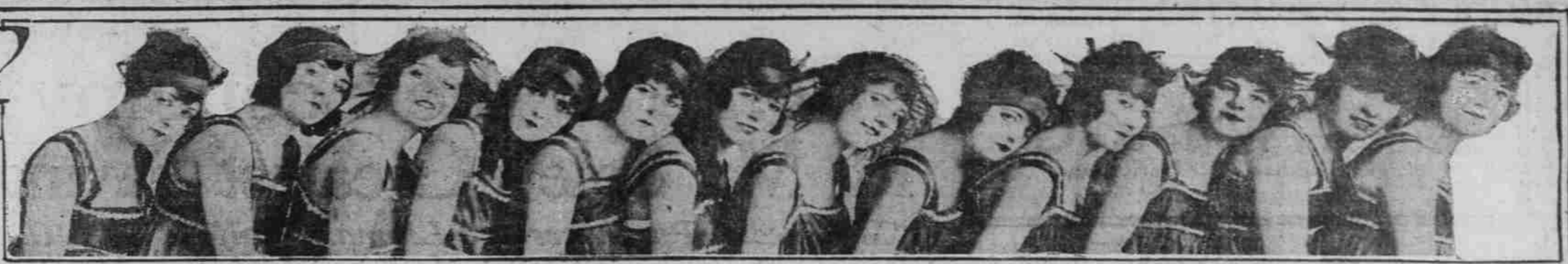
Lyric Rosabud Girls in "Mlle. O'Kissme"