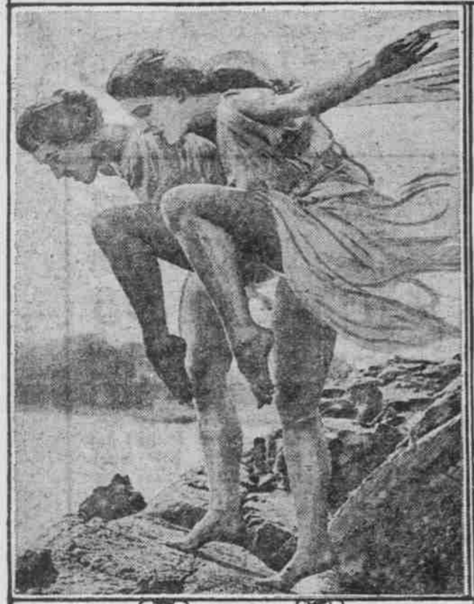
The Marion Morgan Dancers, at the Orpheum.