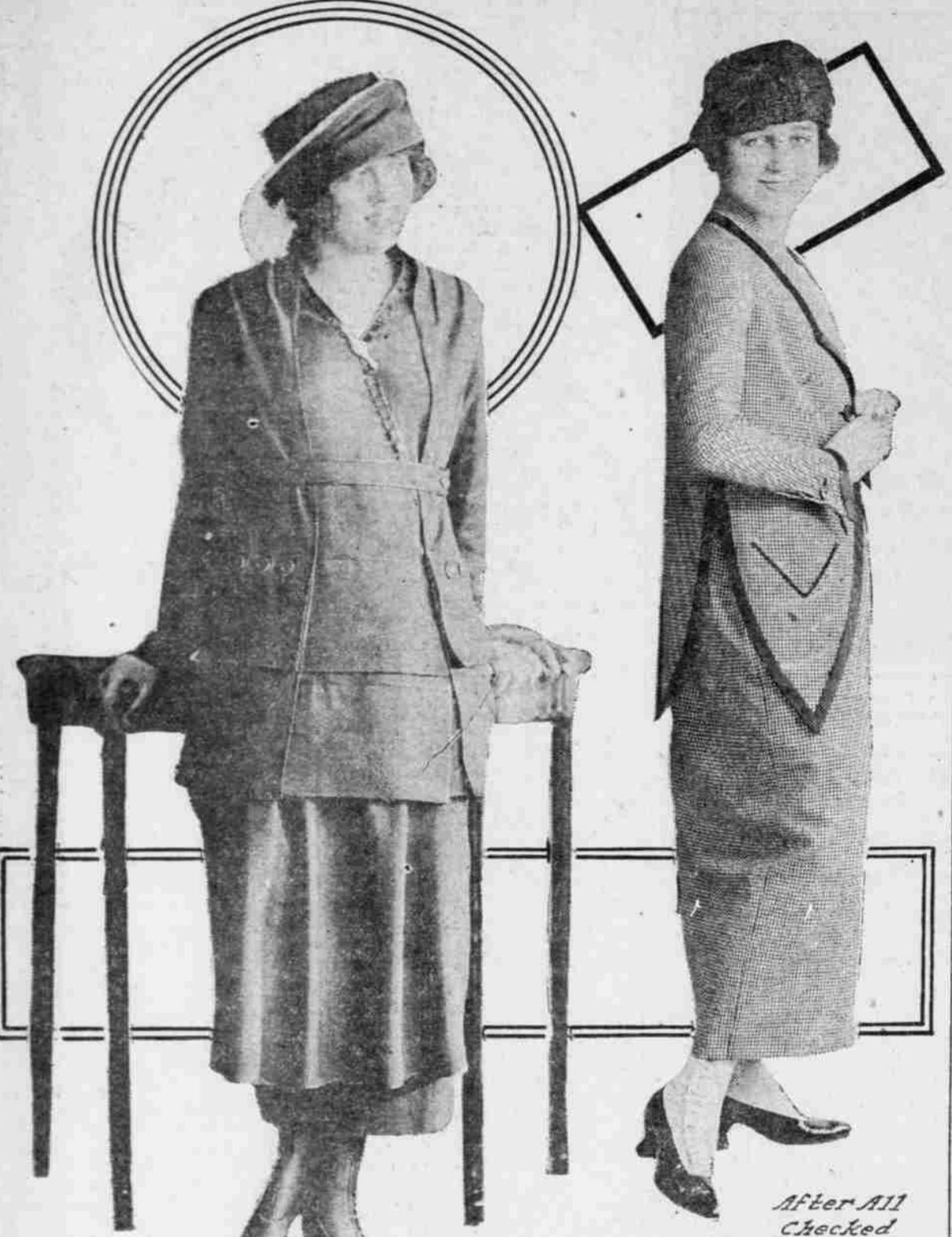
Strictly Tailored But With Soft Graceful Lines.

Paris Dressmaker Takes Idea From Summer Sport Girl—Bernard Model Supplies Chic Little Easter Suit. Checked Velour Suit Brand-New Model.