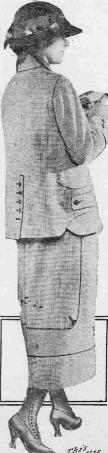
This Suit Has Box And Belt Style Together.

Rhubarb Fritters. Mix together three cupfuls of flour, half a teaspoonful of salt and two teaspoonfuls of baking powder. Beat lightly two eggs, add one cupful of milk and gradually blend the liquid with the flour mixture. Add one tablespoonful of melted olive oil, one tablespoonful of molasses and one pint of drained rhubarb, cut in tiny pieces. Fry in small, thick cakes on a greased griddle and sprinkle with crushed maple sugar as baked.