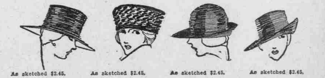
As sketched $2.45. As sketched $2.45. As sketched $2.45. As sketched $2.45.

Hundreds of Smart Untrimmed Shapes Ready at $2.45 —So many women prefer to trim their own hats, and to them these good-looking shapes will appeal.