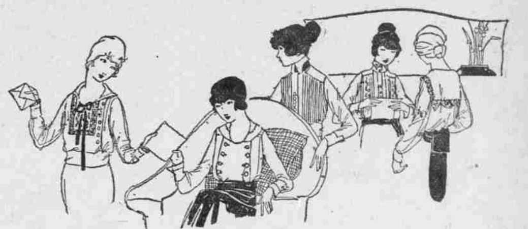
Sketched from models on sale at $4.95.

—The manufacturer from whom we buy most of our "five dollar and over" blouses has recently shown his appreciation for our trade by sending us these 500 blouses at a very special price concession. Ordinarily these would cost very close to the sale price and naturally sell for very much more. But as he has broken all precedent in sending us these blouses, we are breaking all local precedents in selling them at such a low price.