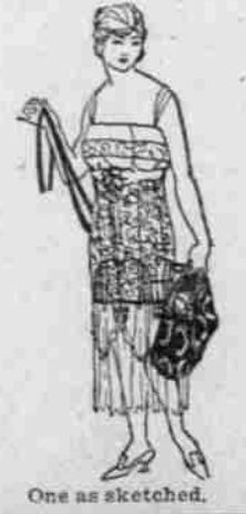
One as sketched.

—It is a simple matter to reduce your hip, waist and bust line from one to five inches and appear ten pounds lighter with a "Stylish Stout." —We will gladly fit one to your individual requirements and feel sure that you will be delighted. It will be possible to wear more striking colors, smarter styles and better-looking clothes with one. Priced $8.50, $15.00 and $20.00 Fourth Floor—Lipman, Wolfe & Co.