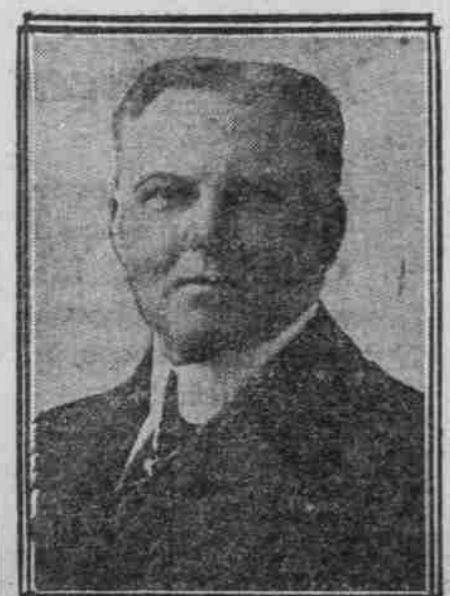
is paid by old friend.