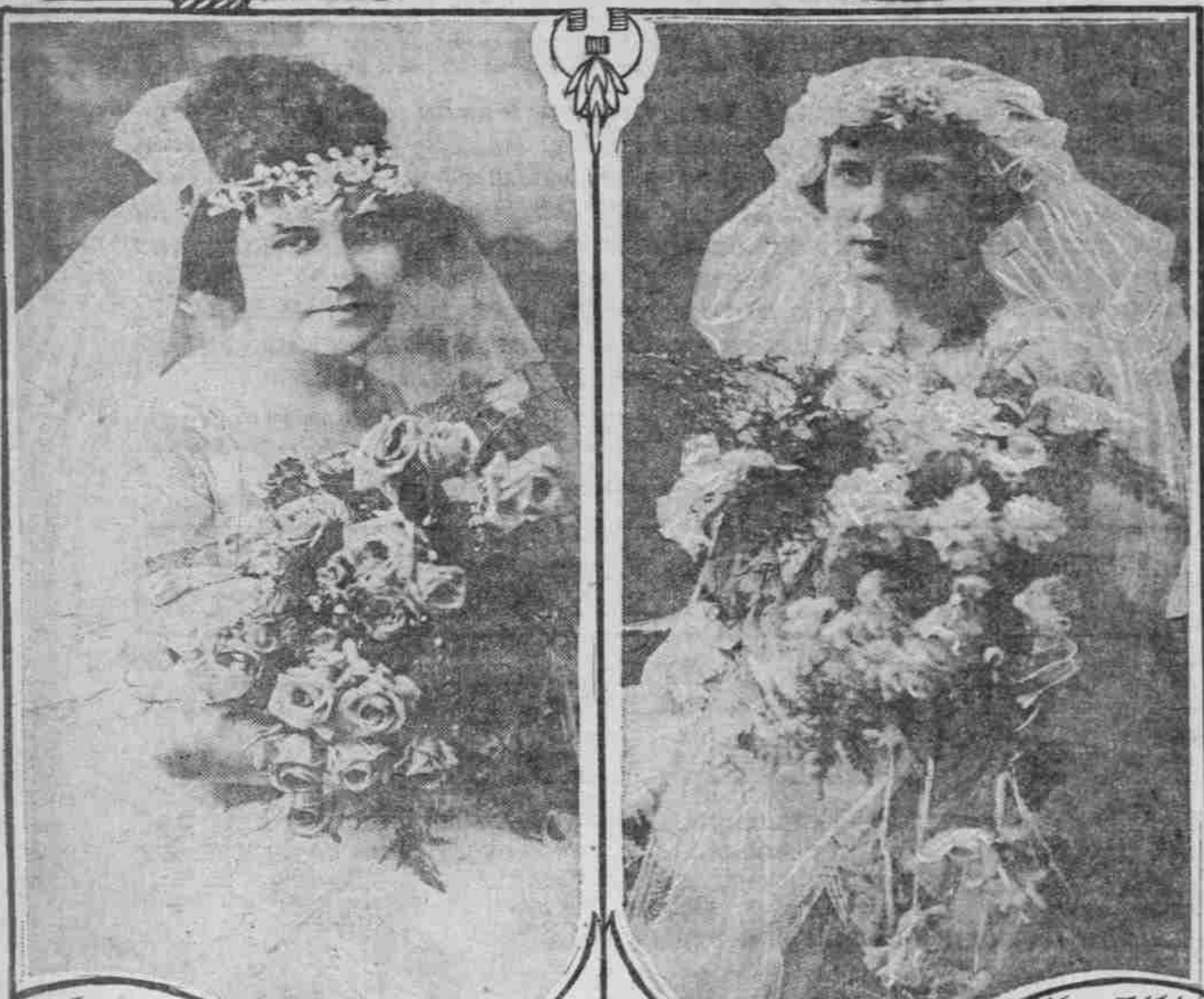
A QUINTET OF POPULAR BRIDES OF RECENT DATE.