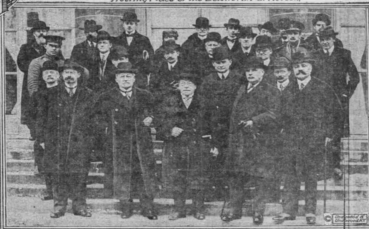
Commission International Legislation on Labor, Which Met at Paris, Feb. 12th.