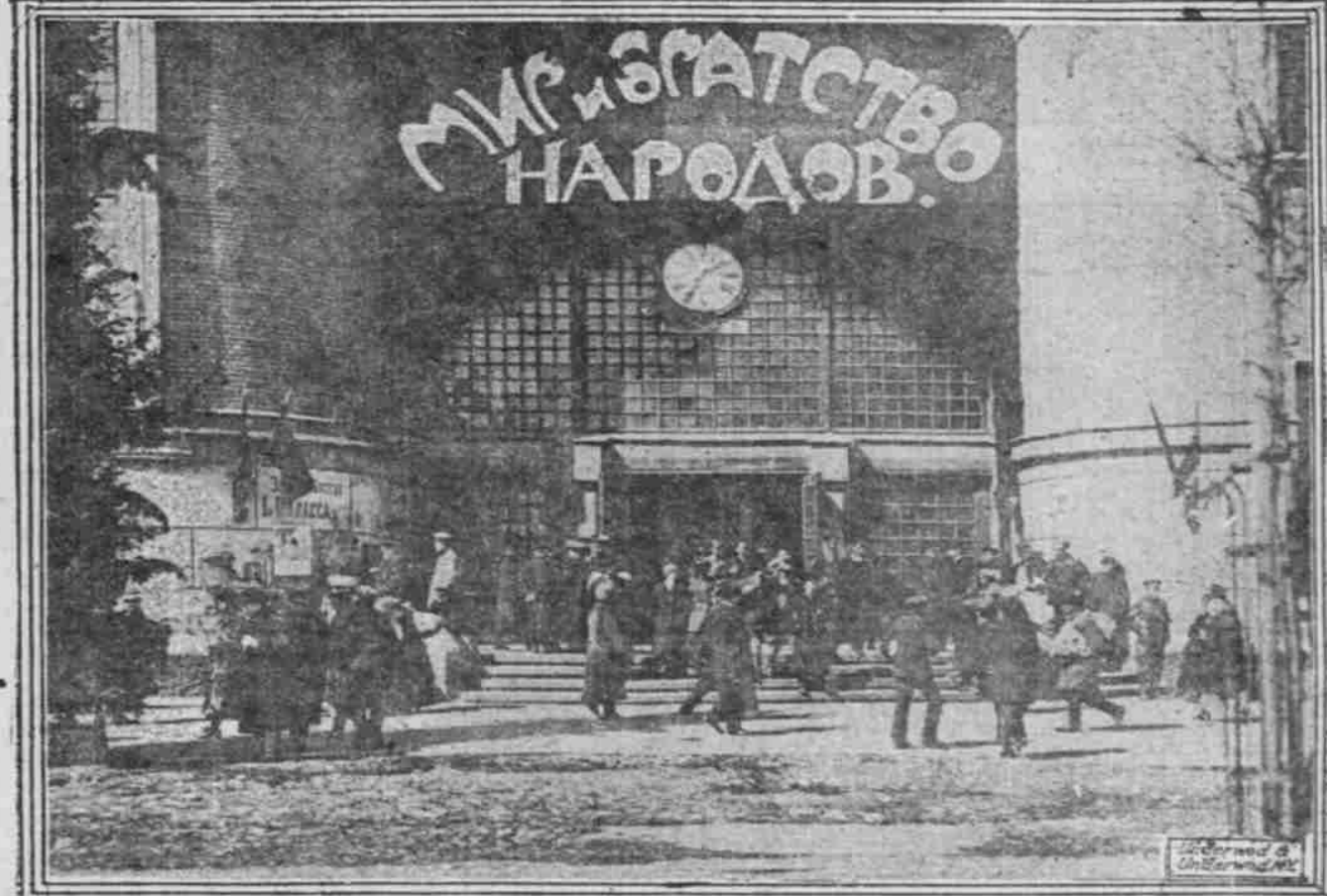
Meeting Place of the Bolsheviki at Moscow.