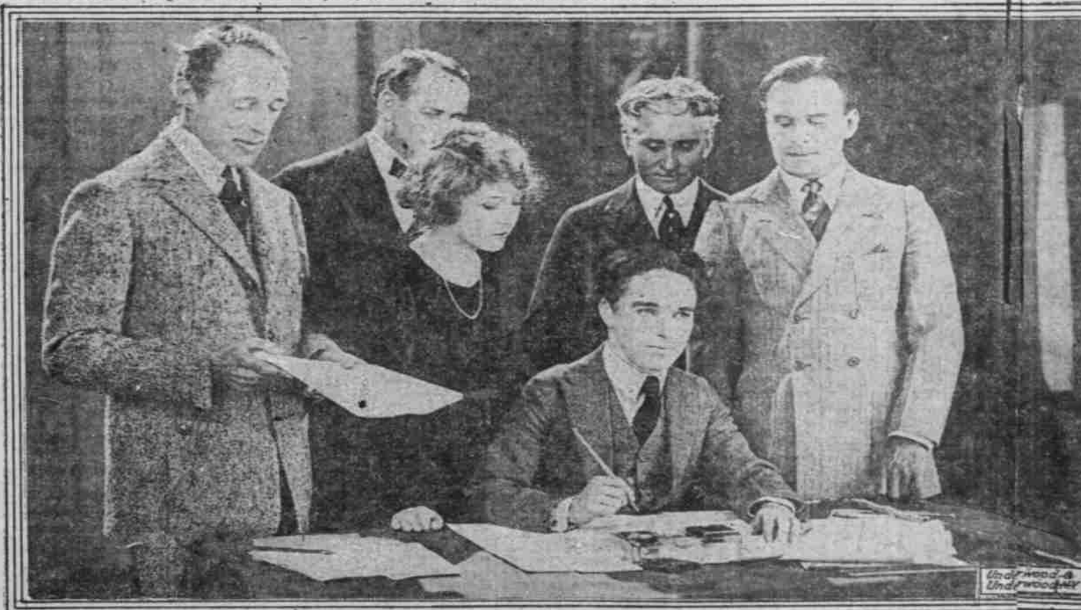
The Big Four of Filmdom Signing Contract Forming The Artists' Combine.