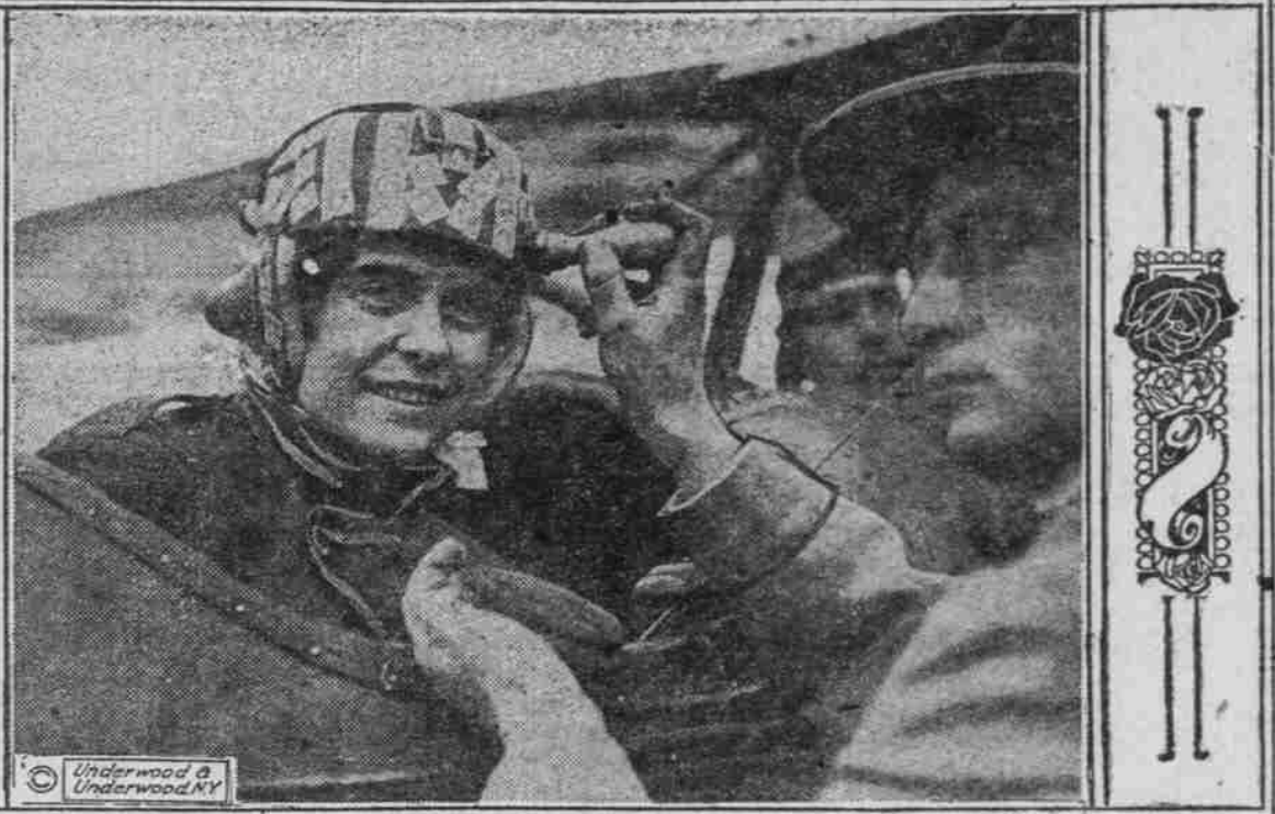
Beautiful Girl Sent by Aerial Post at San Diego, Cal.

POSTAGE stamps affixed to a helmet worn by a beautiful girl, the stamps duly canceled, served for transportation of the most valuable "parcel" yet sent by aerial post. This charming parcel was dispatched from the postoffice at San Diego and safely delivered at destination.