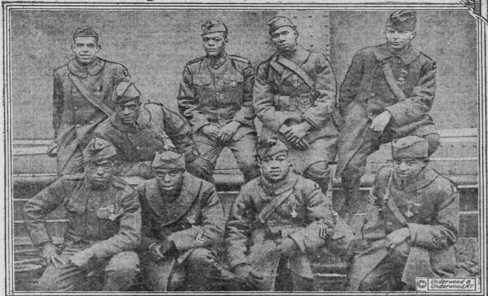
Colored Heroes of the 15th, Won the Croix De Guerre.