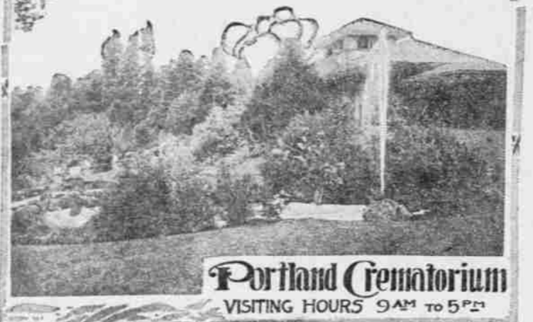
Portland Crematorium VISITING HOURS 9 AM to 5 PM

MANKIND owes a high duty to the sacred dead—and this is incomparably the better way. To those who do not believe, come and see.