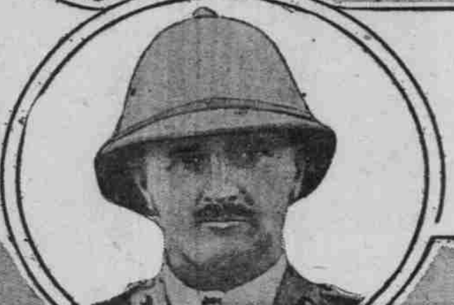
To the left—General Sir, Edmund H. H. Allenby, the Deliverer of Jerusalem