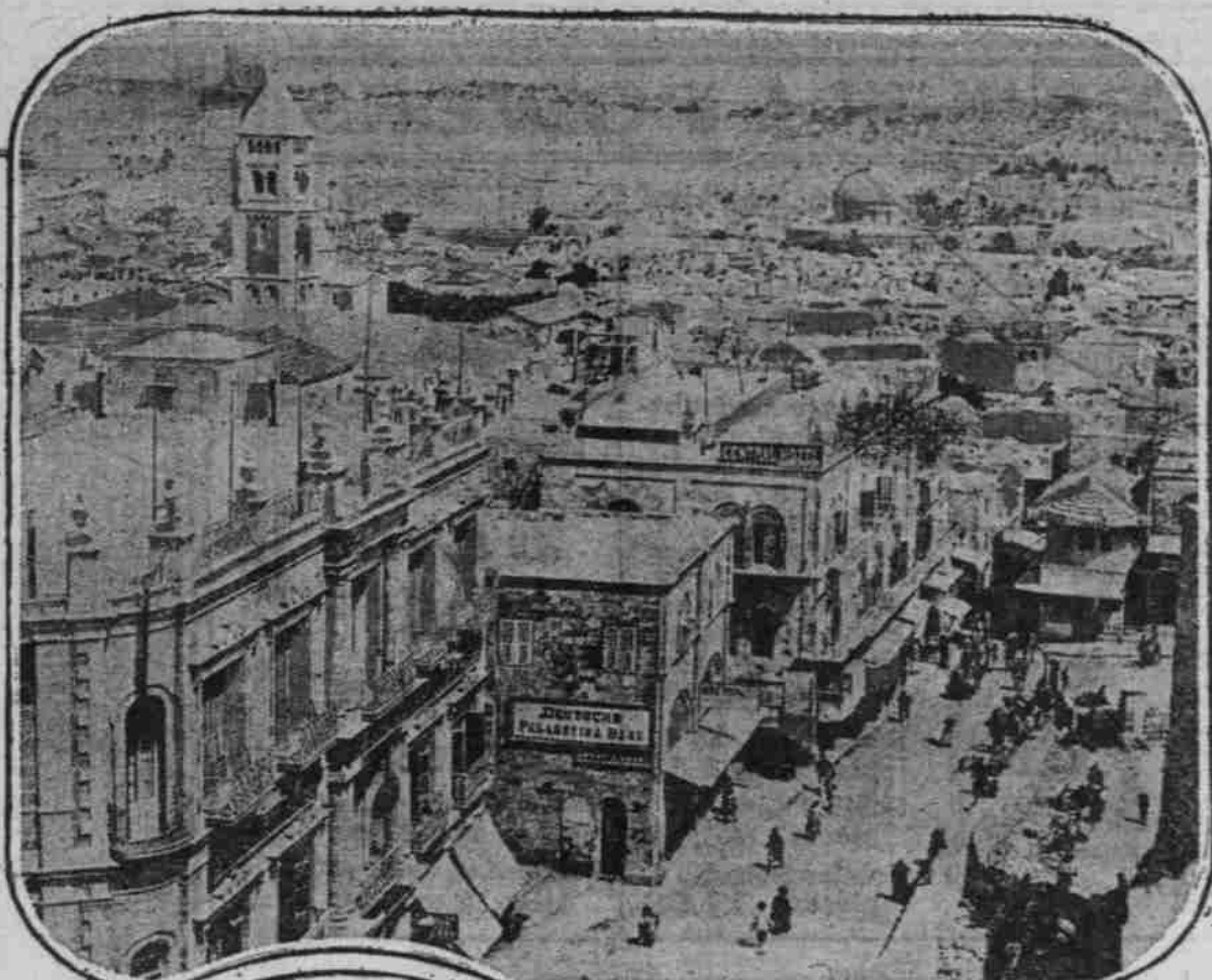
Overlooking the modern city of Jerusalem as it appears to the tourist of today