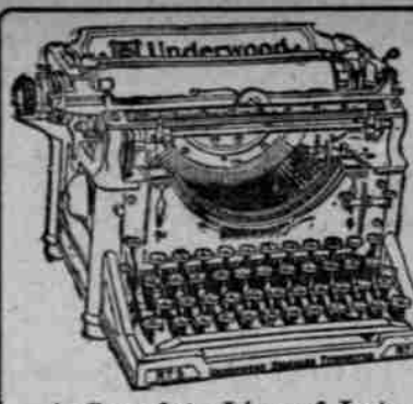
A Complete Line of Late Model

At the house itself an army of work-men and servants were busy cleaning and replacing furniture, paintings, por-traits and beautiful marble statuary.