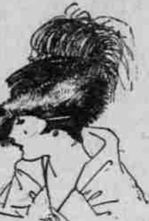
(Hat as sketched, $5.00)

—Japanese lacquered table lamps, in varied styles, with Cheney silk.