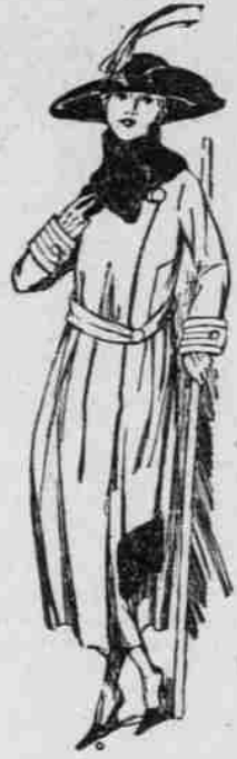
—Meier & Frank's: Apparel Shop, Fourth Floor.

Other new coats in belted or half-loose effects with fur collars and cuffs. Prices range from $19.50 to $100.