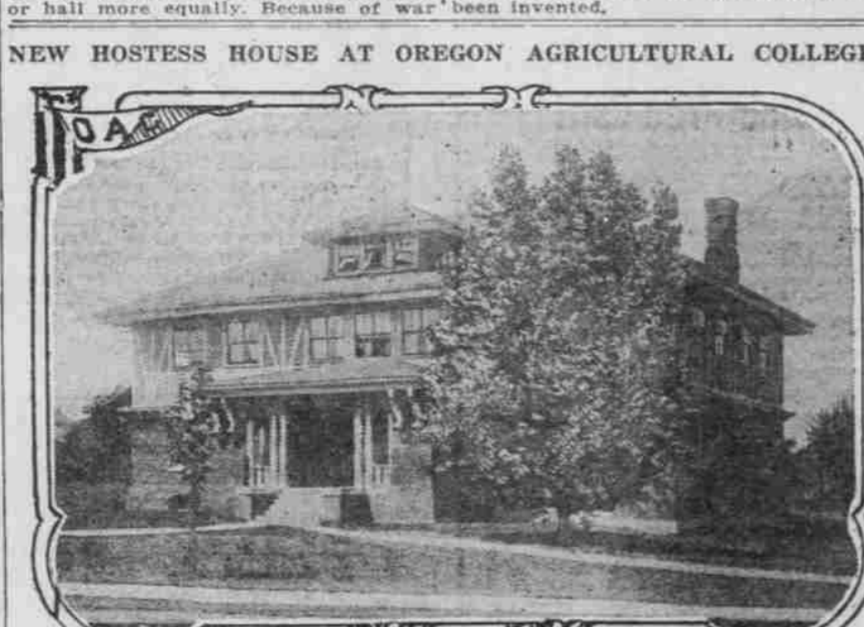
NEW HOSTESS HOUSE AT OREGON AGRICULTURAL COLLEGE.