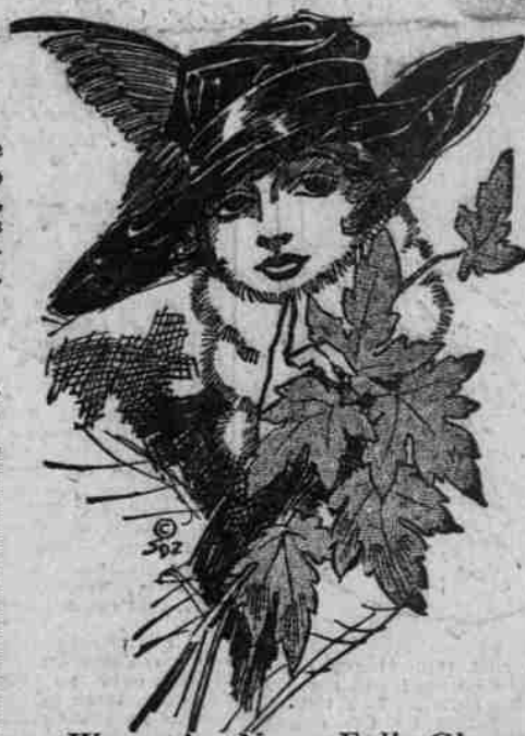
Women's New Fall Gloves —Celebrated "Chateau" French Kid Gloves, also many other well-known makes. All the very newest styles and shades. Priced $1.75 to $3.75 pair.

—Women's Union Suits, low neck, sleeveless style with tight knee. Nicely finished. Special, per garment 69¢ —Band top Union Suits. Medium weight. Priced special, per suit 85¢ —Extra quality Hiale Union Suits. Specially priced at only $1.00 —In All Departments Except Groceries.