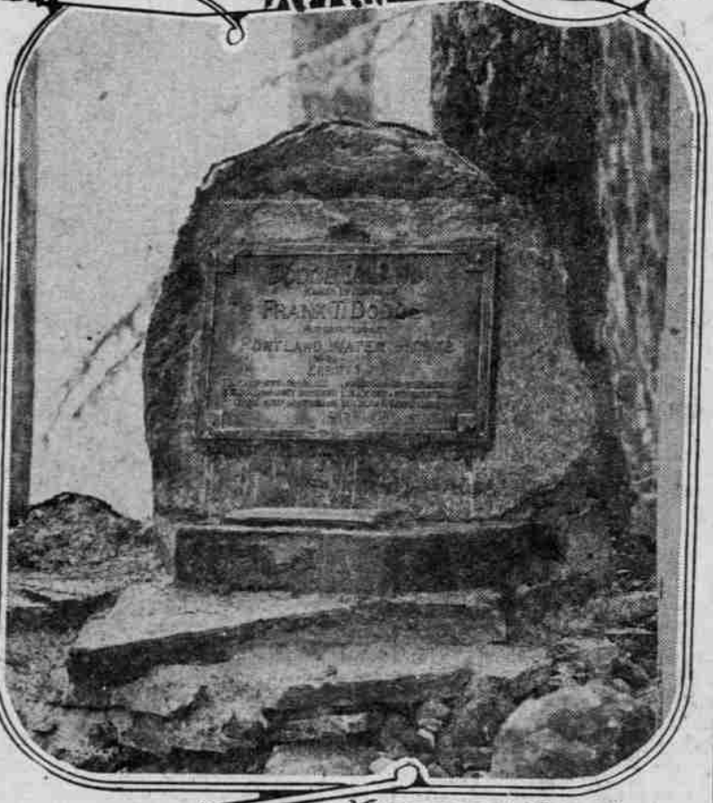
Monument Erected to Frank T. Dodge

Watershed's Protection Obtained. The trip was made in order that a stone monument, erected on an island in Bull Run Lake, might be unveiled in honor of the man who 21 years before had tramped over the same hills for the sole purpose of gaining for the citizens and future citizenry of Portland an inexhaustible supply of pure mountain water.