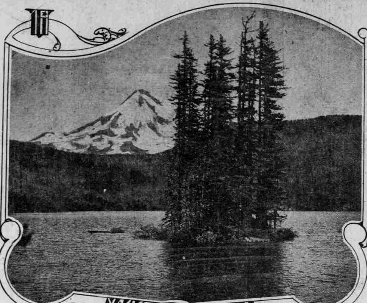
Dodge Island, Bull Run Lake

Party of Portland Citizens Makes Trip to Reserve to Pay Tribute to City's Benefactor—Spirit of Water Bureau Official Lauded.