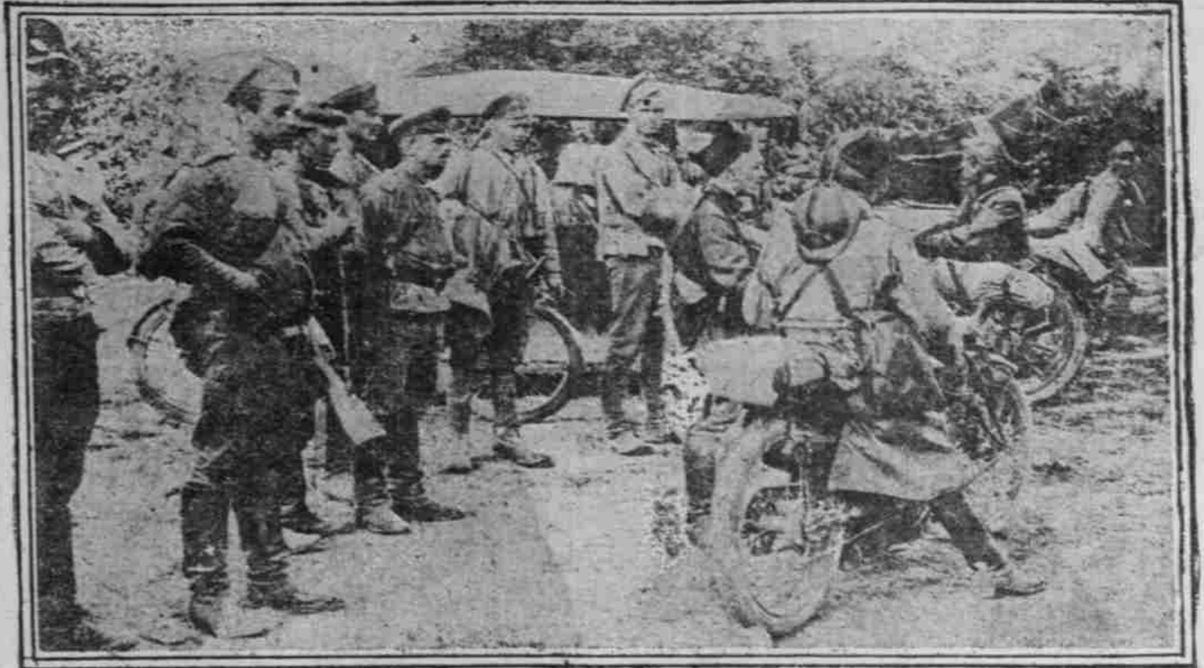
Belgian Dispatch Bearer on Bicycle Returning From Front Line Reconnaissance.

Only recently these Belgians arrived in San Francisco and were tendered a wonderful reception. Lately they have been in New York. Now they are returning to their native country to battle again for the freedom of their nation from Prussian domination. And they go forward eager to join forces with the Americans, who have come into the great war since these remnants of King Albert's gallant army first opposed the Hun at Liege and Namur.