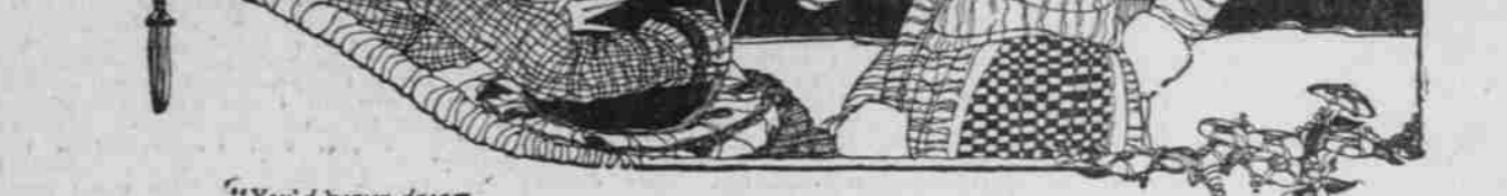
"You'd never dream it was washed!"

The furniture is a delightful informal mixture of old English and Italian types. Between the doors and flanked by a pair of six-foot carved candle sticks is a wonderful old credence, with