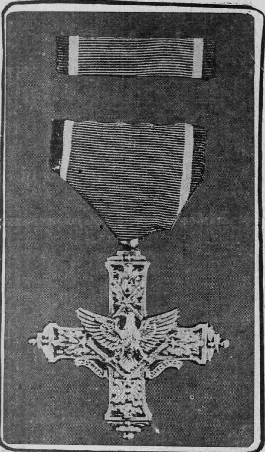
Committee on Public Information - From Underwood Underwood NY American Decoration for Valor.