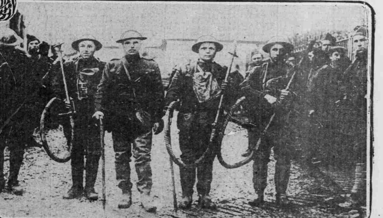
Liquid Fire Machine Captured By Americans