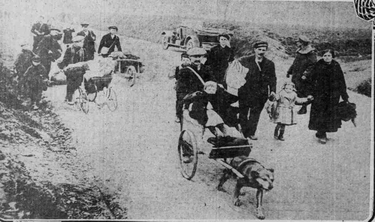
Refugees Flee From Battle Zone.