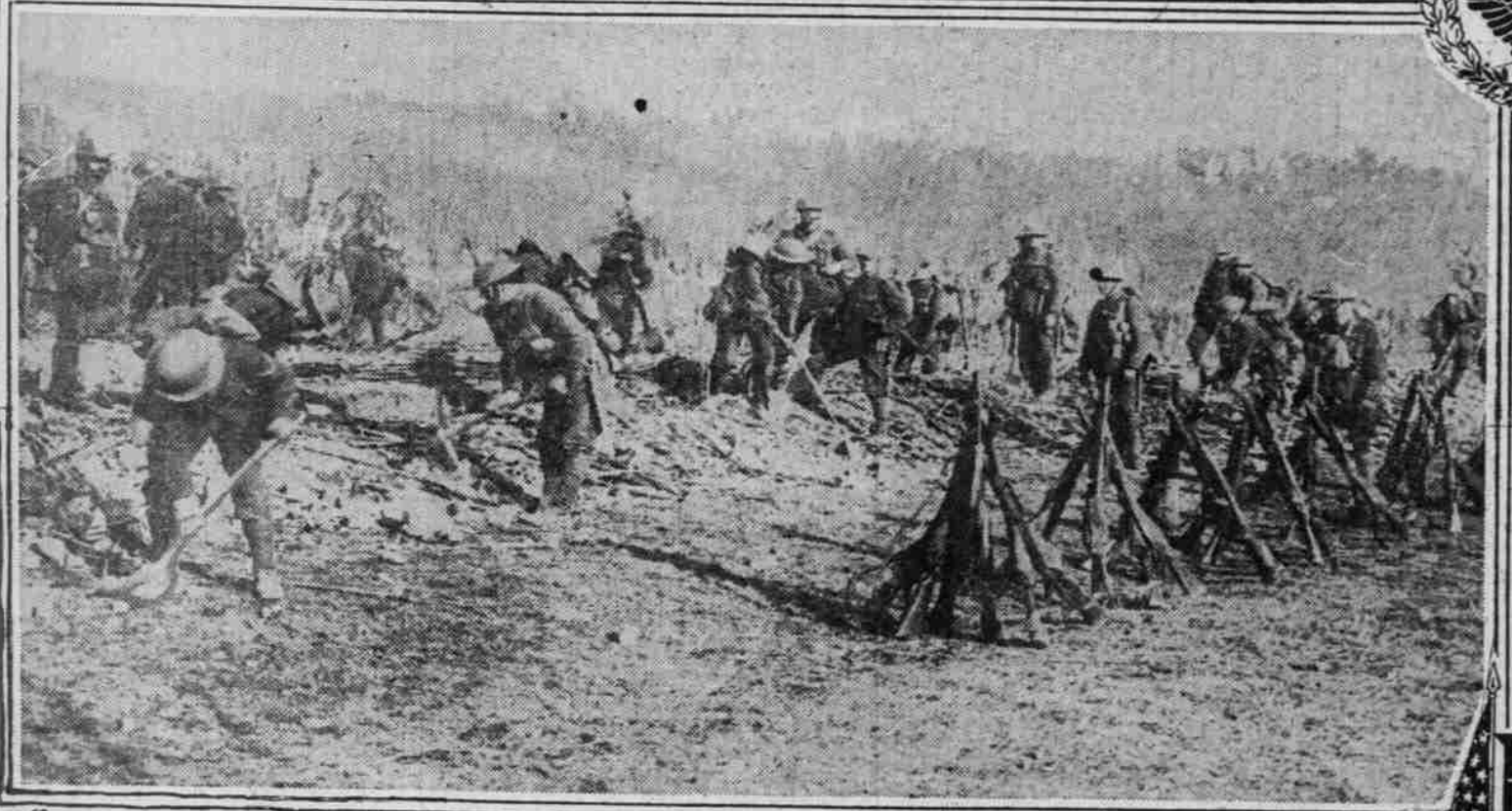
© VFA British Soldiers On Italian Front. British Official Photo.

Committee on Public Information - From Underwood Underwood NY