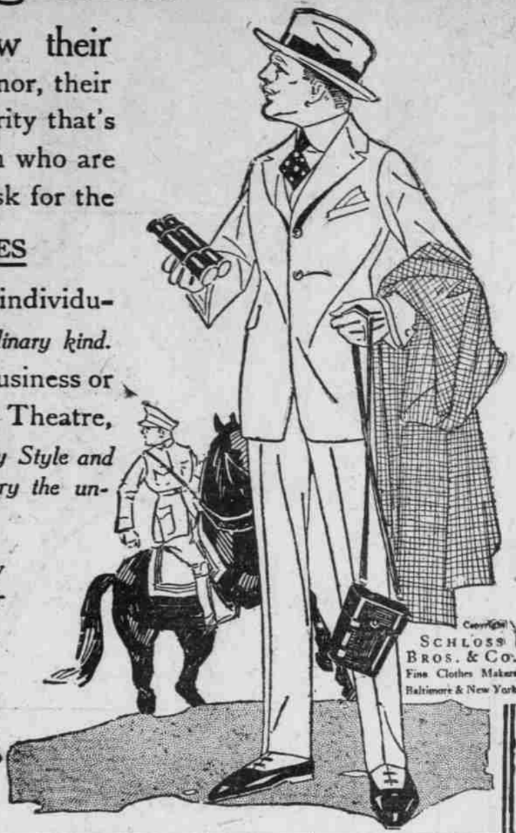
SCHLOSS BROS. & CO. Fine Clothes Makers Baltimore & New York