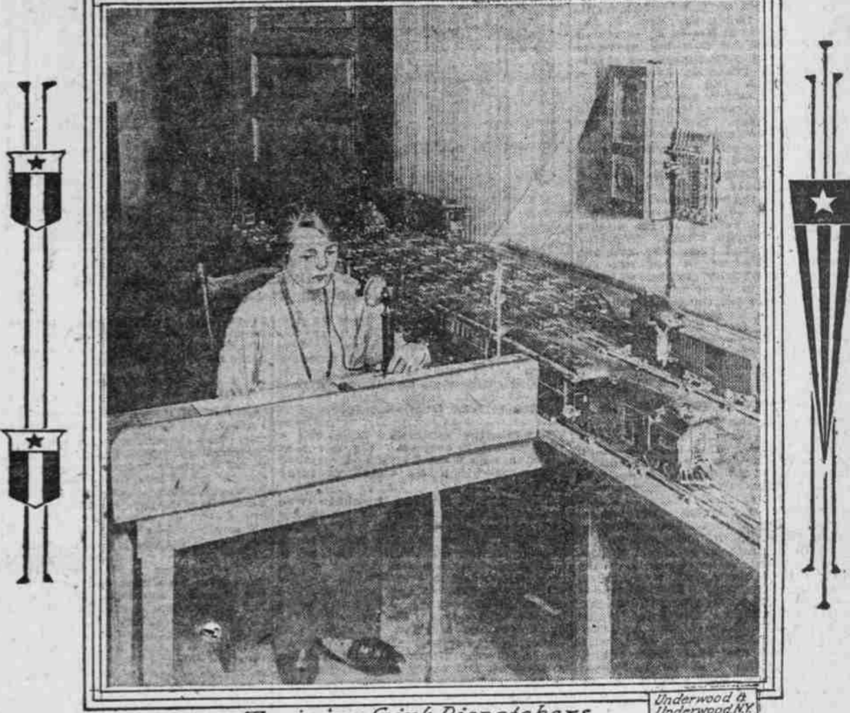
Training Girl Dispatchers.

Girl Dispatchers Training. Women will soon have another man's job and it is a mighty good one, too. They have made good at every position that has been opened to them so far, so the Pennsylvania Railroad is giving them the opportunity to learn to be train dispatchers. Of course, they won't step right from the school to the job of guiding trains through the intricacies of terminals and yards. They will first have to serve apprenticeships just as the expert men dispatchers did, as telegraph operators along the line of the Pennsylvania system.