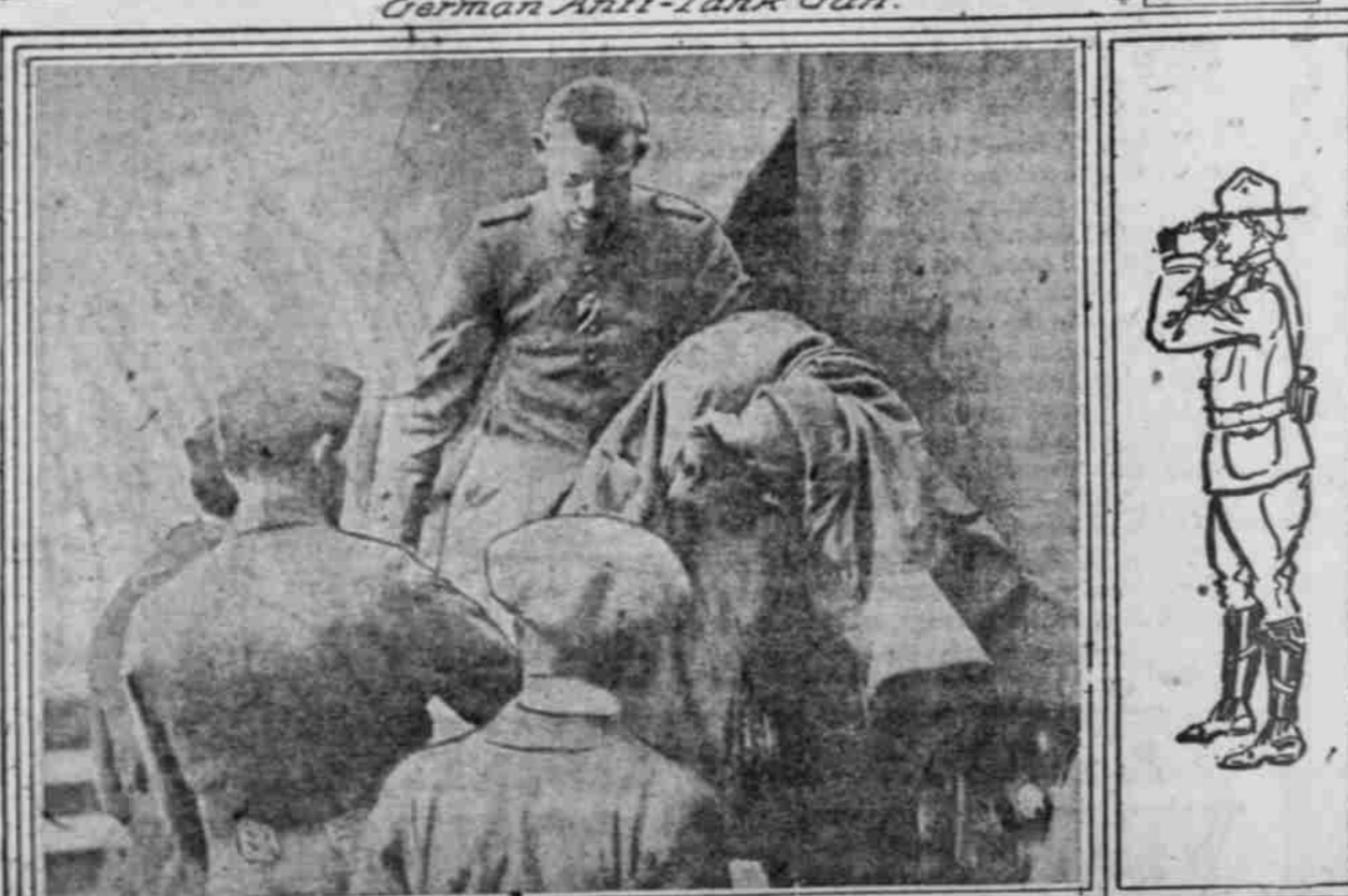
Captured German Raider Crew.

German Raider Crew Captured. In a recent raid over England by a number of Gotha machines, two of the German planes were brought down and six occupants captured, despite the fact that the raid was made in the early morning hours. In a British official photograph one of the captured German pilots wearing the iron cross ribbon is shown leaving the car which brought him to the detention camp.