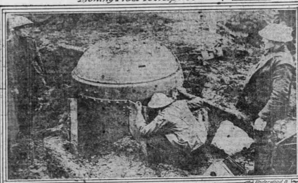
German Anti-Tank Gun.

German Anti-Tank Gun. The British tanks have the Germans on the jump trying to create a force or contrivance that would stop them. The latest thing they have produced is a heavily armored turret which appears as a small blockhouse on the battlefield. A gun is mounted in the turret, but the tanks have swept by these armored blockhouses as though they were not there. The first photograph to arrive in this country showing the new anti-tank gun shows one that has just been captured by the Anzacs, who are shown examining it. To get inside it is necessary to get down on hands and knees and crawl.