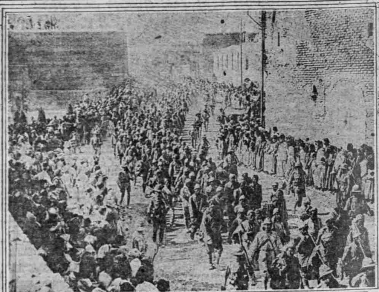
Turkish Prisoners in Bagdad

Dogs Are Man's Best Friends on Battlefields—German Contrivance to Stop Tanks Is Failure—Dutch and Teuton Officers Closely Examine British Prisoners.