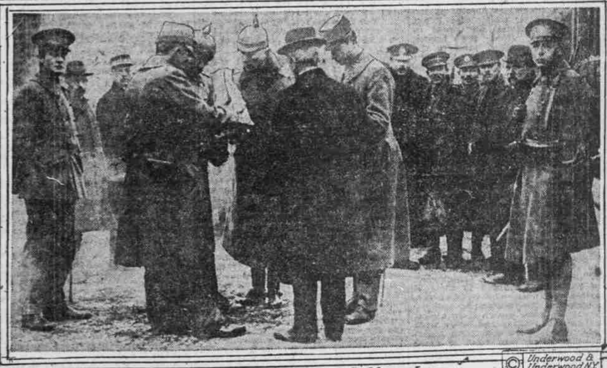
British Prisoners in Holland.

No other photograph of this kind has arrived in the United States since the beginning of the war.