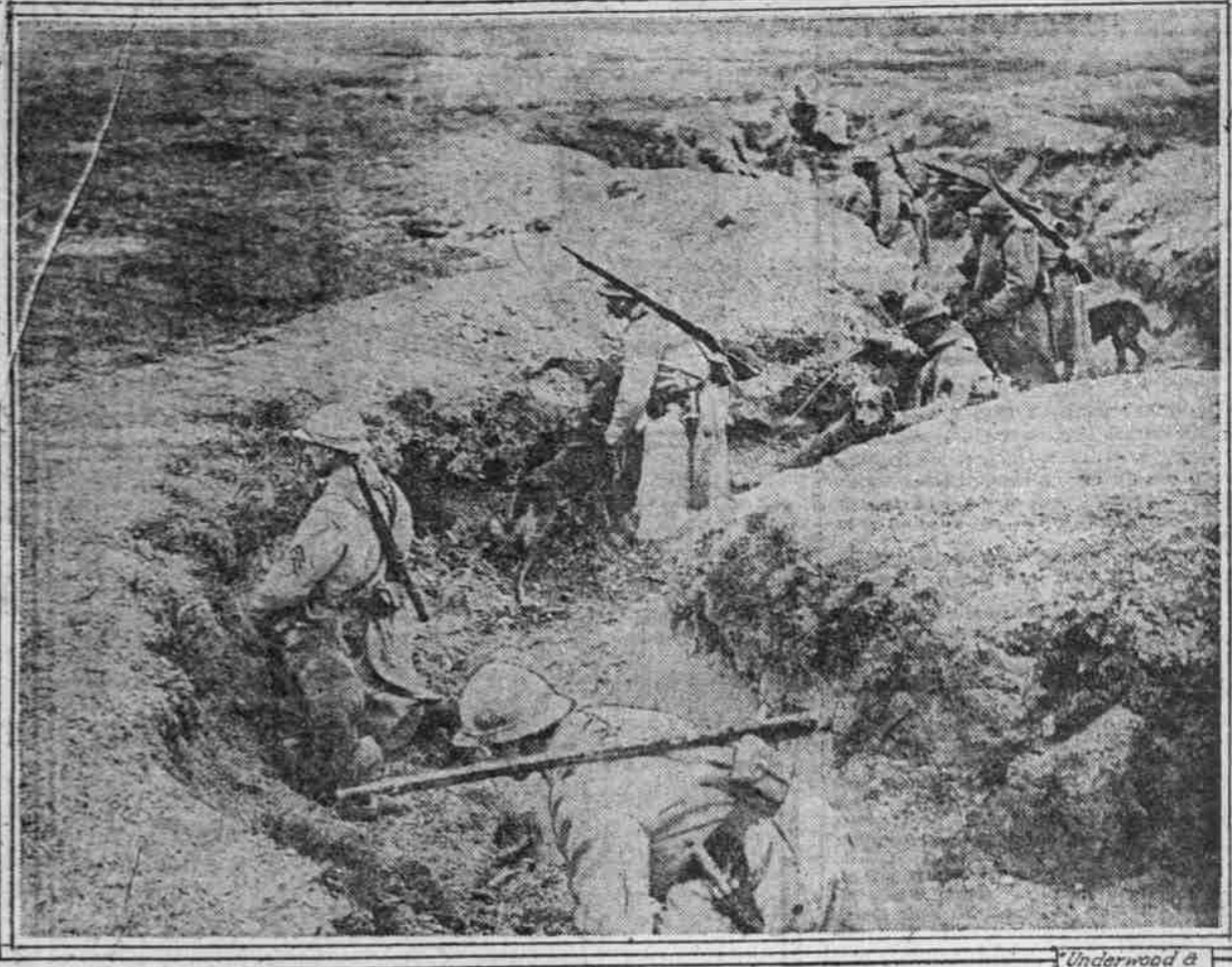
Real Dogs of War On Duty.

Real Dogs of War on Duty. People often talk of the "dogs of war," but the dogs they think of are far different from the real war dogs now playing a wonderful part in the trenches. The releasing of these dogs is not the sign of conflict, but of success for those who have fallen. Dogs are used extensively to aid the man of the medical corps find the wounded. Often they act independently in bringing aid to the hurt until there can be carried back to their own lines. As everywhere else in the world the dog has proved in the trenches that he is man's best friend. A recent photograph shows the dogs in a portion of trench on the Marne front. The poilus are holding them in leash until they get the opportunity for searching the wastes of no man's land for the wounded and the dying.