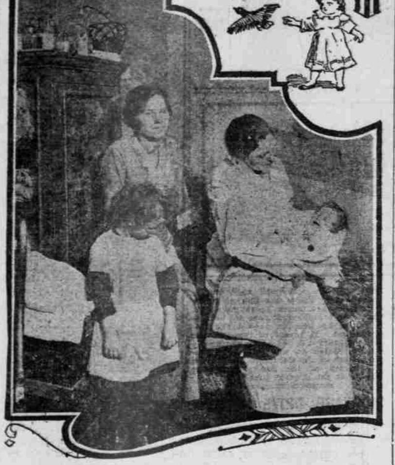
An Italian Family of Children and a Recent War Baby, Who Have Been Under the Care of the Nurses.