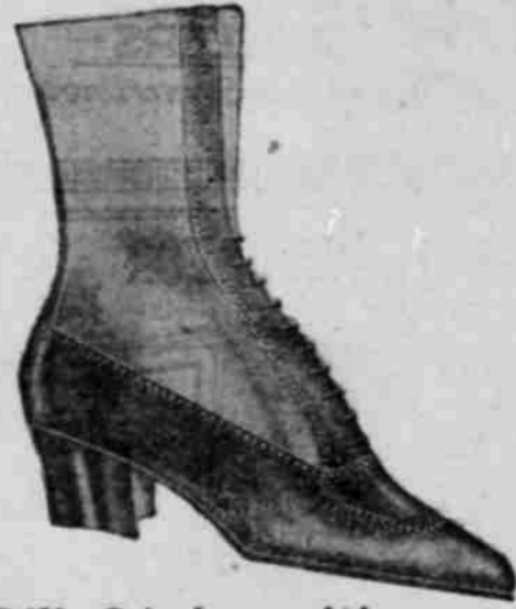
R650-Soft brown kid vamp, dark brown cravenette top, leather lace stay, new "MILLITAIRE" heel. Reduced from $8.50.

A SALE that is different - no fancy inflated prices reduced, but BAKER'S regular close-margin prices greatly reduced - BAKERIZE your shoe money