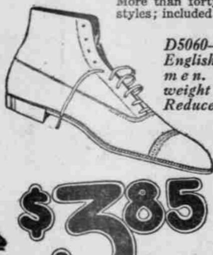
D5060-Black calf English last for men. Medium weight leather sole. Reduced from $5.