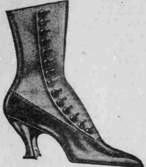
93-Soft black kid vamp, dark gray suede top, hand-turn sole, wood covered LXV heel. Reduced from $10.00.