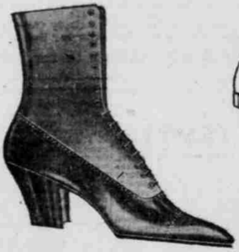
A964-Dark tan calf vamp, fawn buck top, Cuban heel. Reduced from $8.50.

More than forty lines of new men's shoes reduced, all leathers, all styles; included are many styles of the famous NETTLETON shoes.