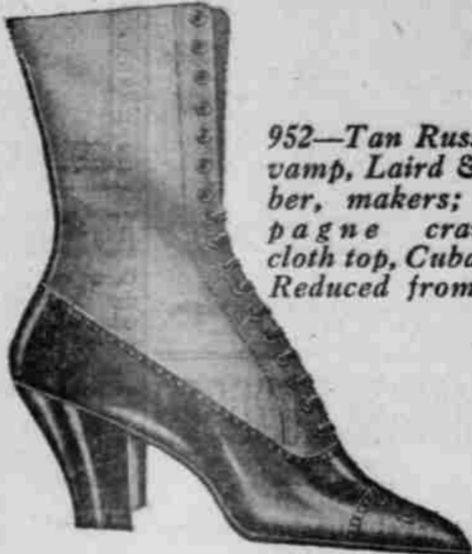
952-Tan Russia calf vamp, Laird & Schorber, makers; champagne cravenette cloth top, Cuban heel. Reduced from $9.00.