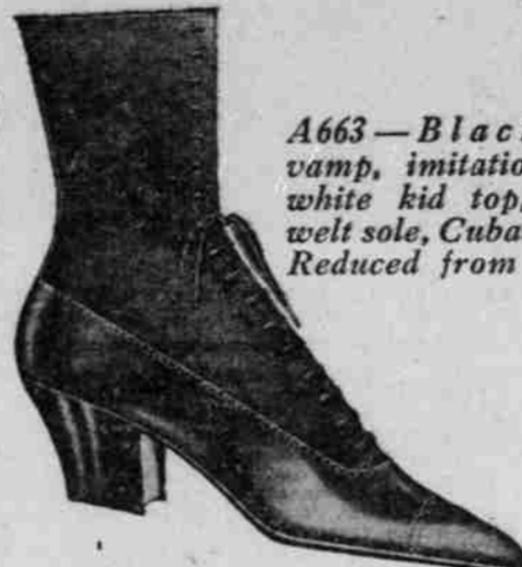
A663-Black kid vamp, imitation tip, white kid top, light welt sole, Cuban heel. Reduced from $9.50.