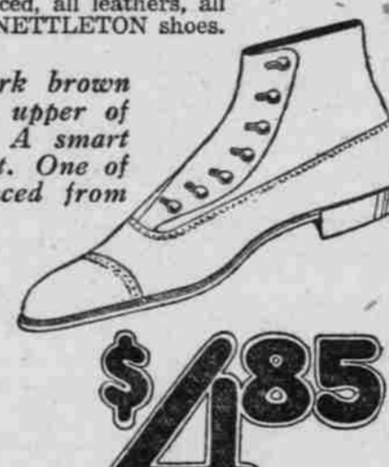
C5511-Dark brown calf vamp, upper of tan cloth. A smart English last. One of many reduced from $6.50.